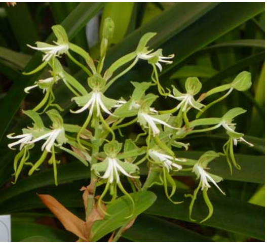
Green Wood Orchid (Bonatea speciosa)

The Green Wood Orchid (Bonatea speciosa) is a relatively easy to grow terrestrial orchid, admired for its delicate green and white flowers. The species is widespread in the southern and eastern parts of South Africa and Zimbabwe where it grows in coastal shrub, on forest margins and sometimes also in savanna up to about 1200 m. At night, the strongly evening scented flowers attract hawkmoths which act as the pollinators of the orchid.