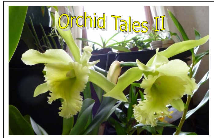
Ports of Paradise [ Rhyncholaeliocattleya Fortune x Rhyncholaelia digbyana ] above; on the right is a Den drobium brymerianum