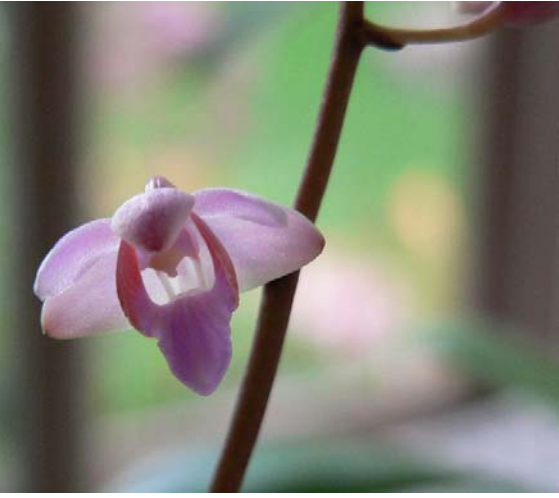
Doritis pulcherrima

Keep in mind, the second part of the challenge will be awarded at the November 2013 meeting for the plant that ends up producing the highest number of flowers during its long blooming period. So please keep a record of the total number of flowers your plant produces, right up till the end! This species is known for its extended