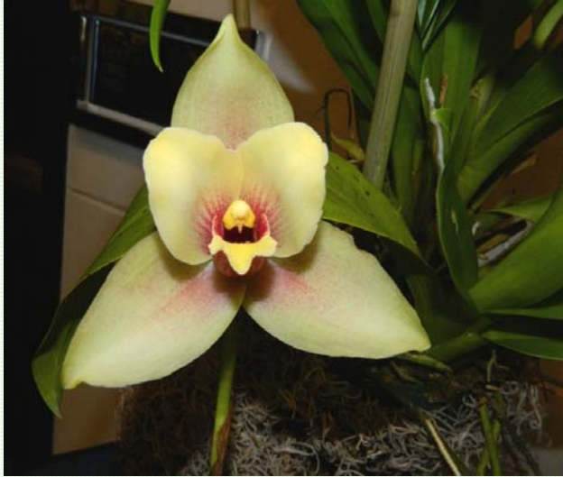
Lycaste (Koolena x Concentration)