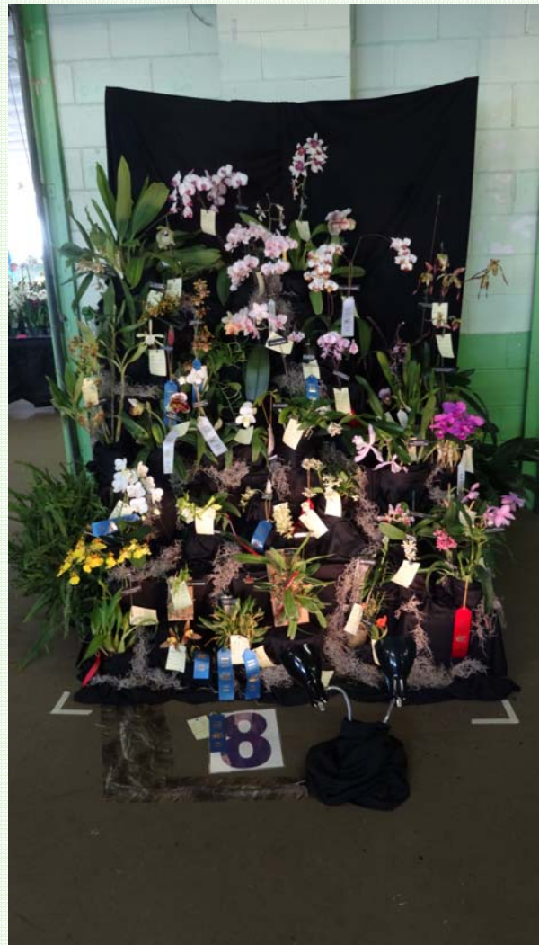
Batavia Show Exhibit