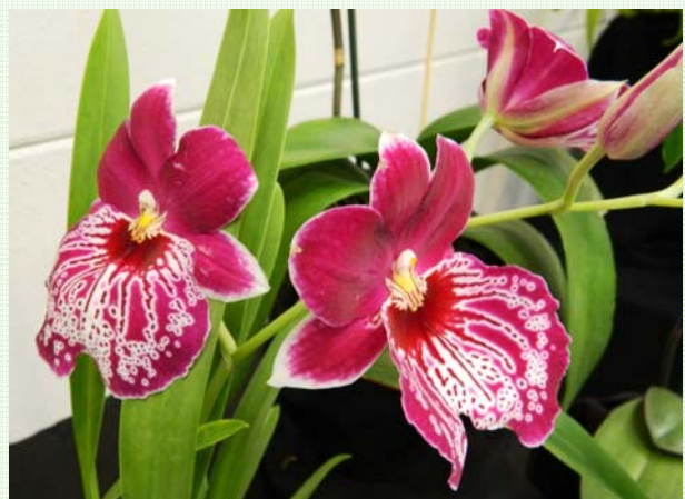
Miltoniopsis Morris Chestnut