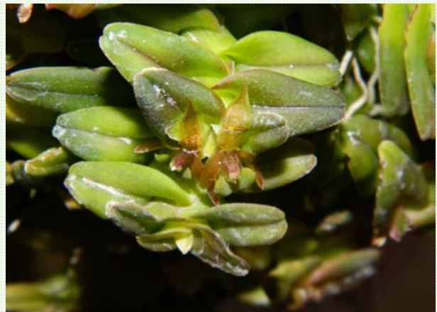
Epidendrum schlechterianum