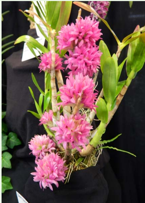
Den tannii