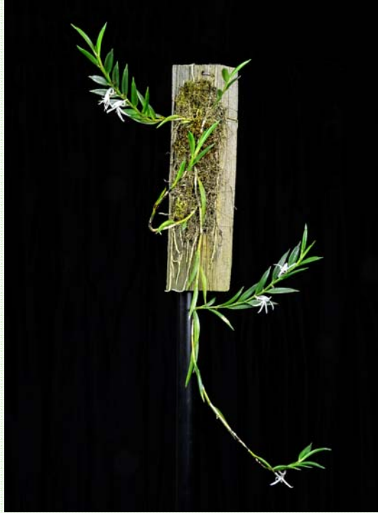
Angem doratophyllum