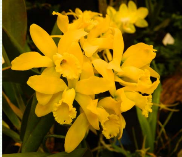
C Pixie Gold 'Muse' AMAOS (cristata x luteola)