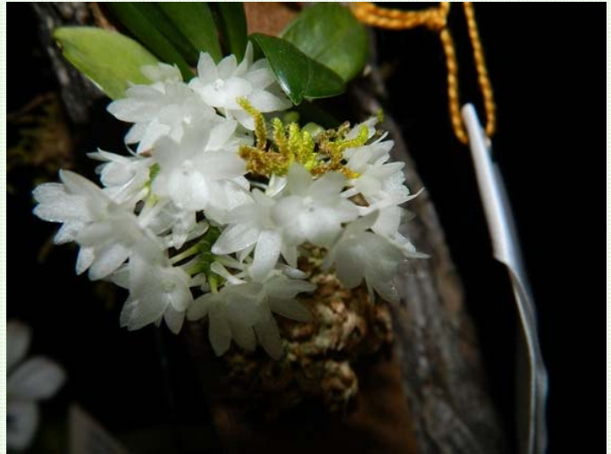
Aerangis hyaloides