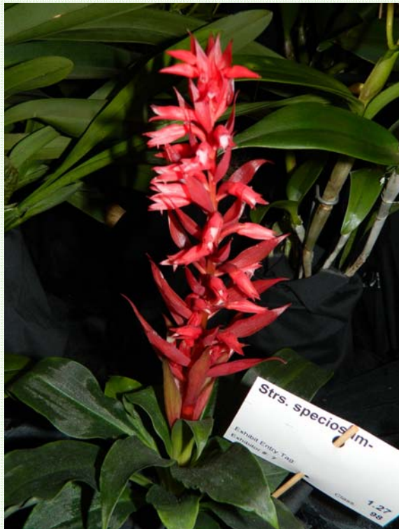
Strs speciosum