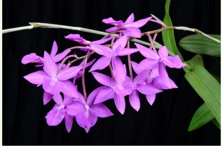
Barkeria scandens