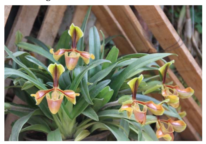
At the Royal Agricultural Research Center in Chiang Mai

Our Thai guide warned us not to touch or sniff