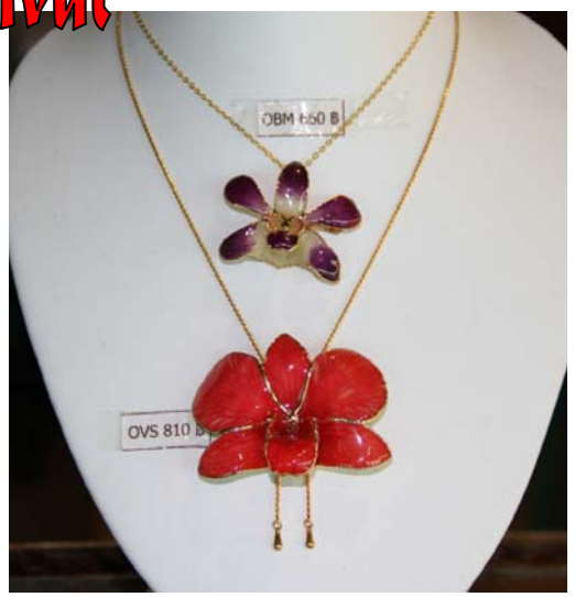
Orchid Farm Jewelry Counter

fresh, which means untouched and unsniffed.