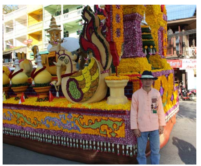
The next day we flew back to Bangkok and had one more day there before we had to return to the frigid weather of Wisconsin.