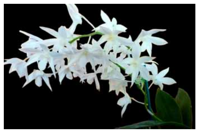
Dendrobium White Grace 'Sato'