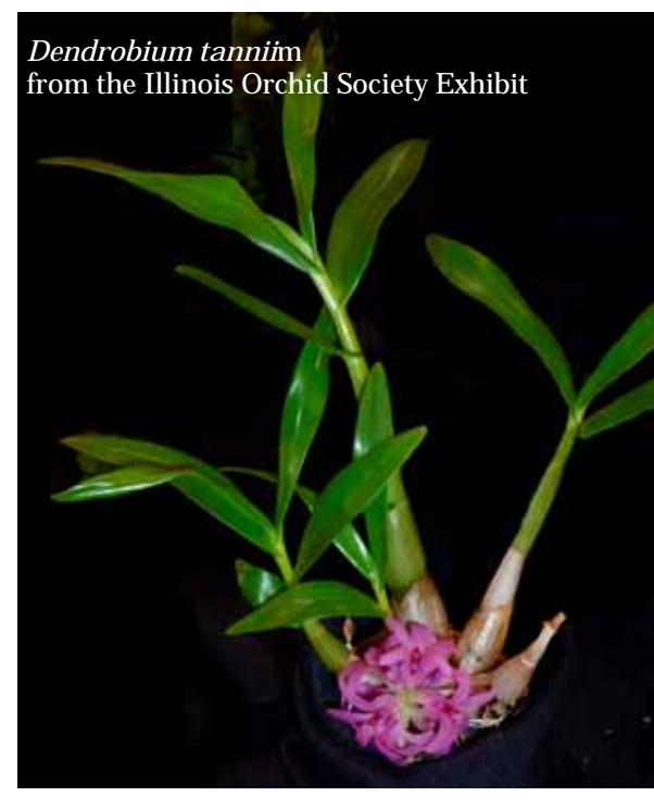
Orchid Growers' Guild, April 2014 page 2 of 7