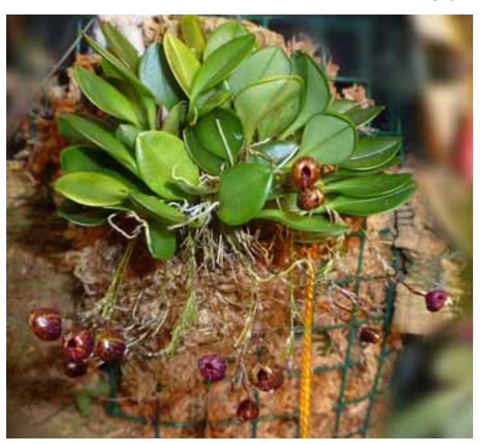
Scaphosepalum ovulare, earned a blue ribbon for Walter Crawford of the WOS