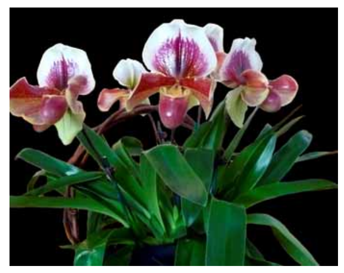
Paphiopedilum Hampshire Harvest (Danella x Valwin) Orchid Growers' Guild, April 2014 page 5 of 7