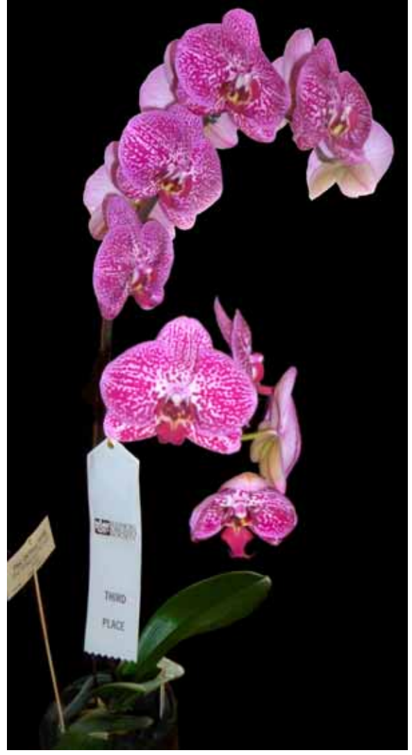
Phalaenopsis OX Prince 'OX1480' (OX Black Jack x Leopard Prince)