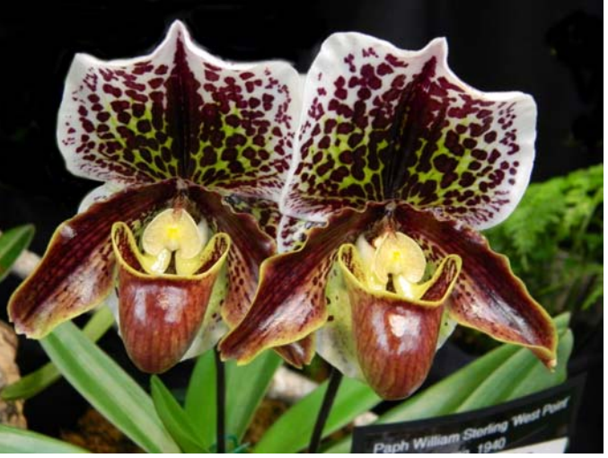
Paph William Stirling 'West Point' (Juliet x Lucifer)