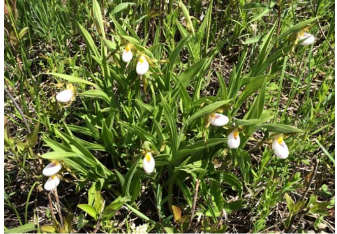
Cypripedium candidum , also known as Small White Lady's Slipper or White Lady's Slipper. It is found in wet prairies and fens, in rich, highly calcareous soils, sedge meadow edges, calcareous roadside and railway ditches

After parking on the verge of a narrow road, we walked past a no trespassing sign and followed a farm road for about 100 yards with standing water in ditches. The road passed through thickets of trees and brush which then opened up into a large meadow, the prairie. Around ten years ago this open area was also covered with thickets. The brush