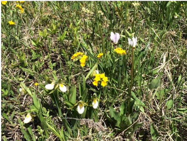
These Lady's slippers are surrounded by other wildflowers including shooting star and Hoary Puccoon

was cleared and during the intervening years it has alternately been burned or mowed to control invading trees and shrubs. This was once a farm field that was apparently abandoned long ago but mostly uncorrupted so that when the brush was removed, seeds were waiting in the soil to spring back to life. As the years pass, more and more species of prairie plants have emerged.