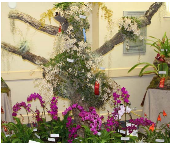
Orchid Growers' Guild, June 2014 page 3 of 8

One of the highlights of the show was the