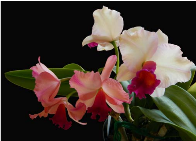
The blooms change color as they mature. Slc Circle of Life 'Trailblazer' x Lc Magic Melody 'SVO' AM/AOS