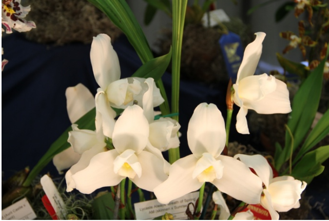
I believe the best plant in the show was this Lycaste by New Vision Orchids.