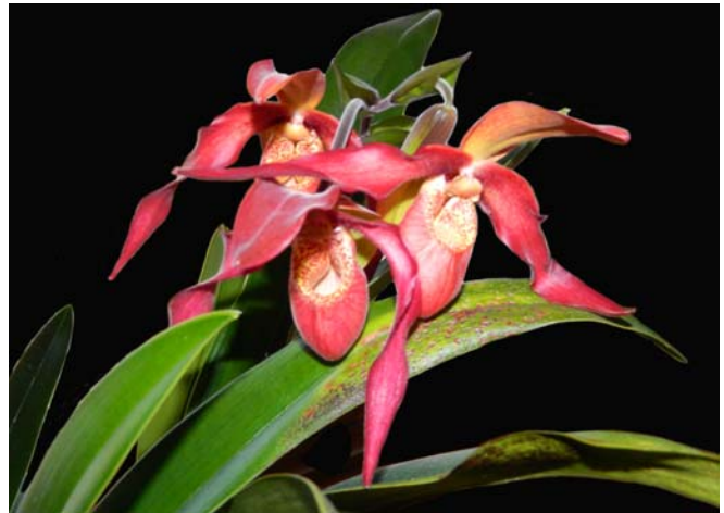
Phrag (Rosalie Dixler 'FV' AM/AOX [ Phrag. besseae x Phrag. kaieteurum ] x caudatum var sanderæ 'Select')