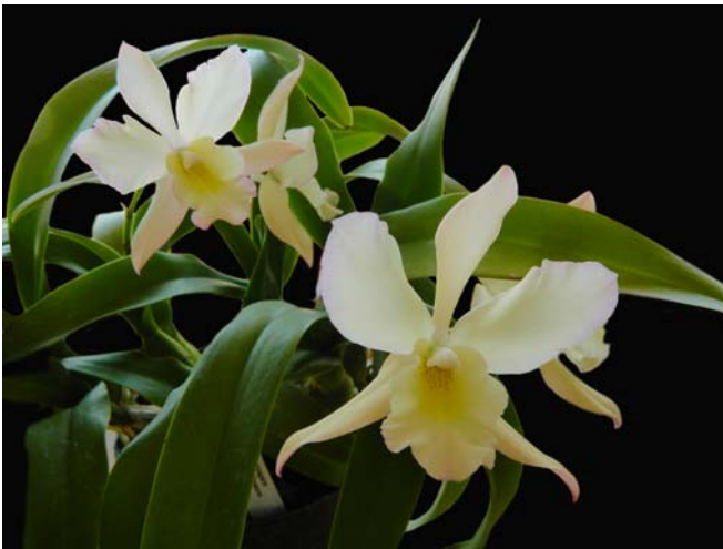
Iwanagasa Apple Blossom 'Fantastic' Orchid Growers' Guild, June 2014 page 6 of 8