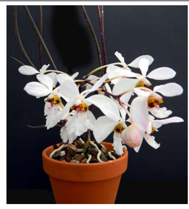
Holcoglossum wangii, from southern China and Vietnam.