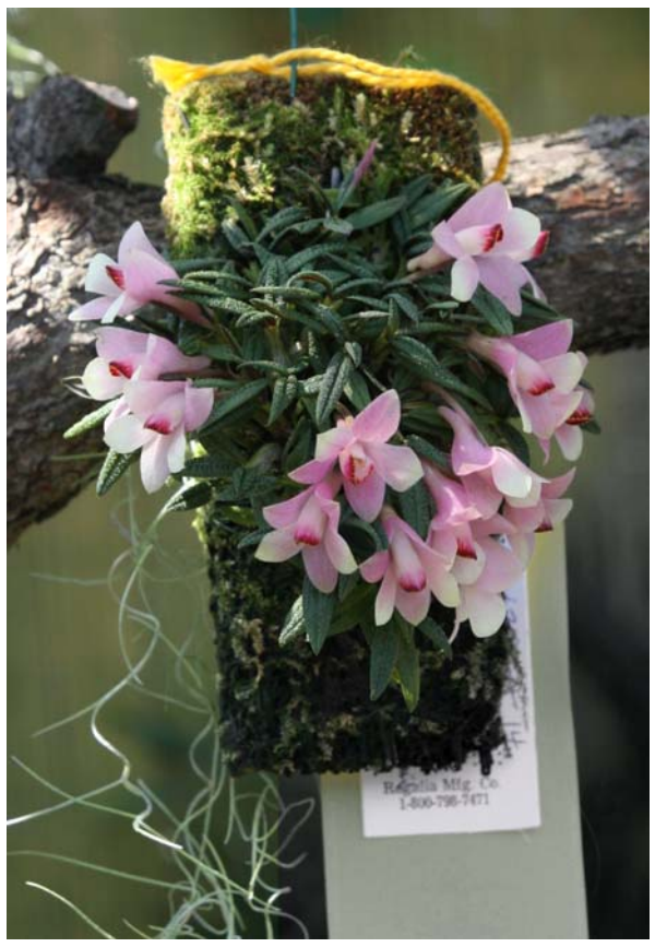
Clock-wise from top left: OGG Exhibit, Dendrobium cuthbertsonii and Lycaste Guatemalensis