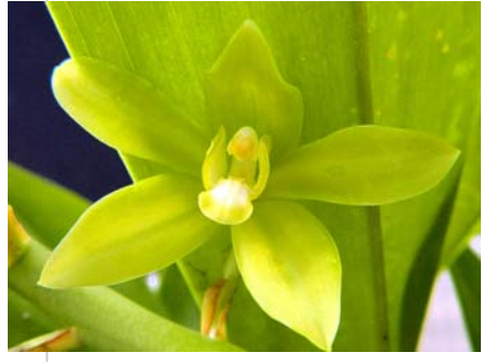
Grammatophyllum scriptum v. citrinum, from Orchids Garden Centre