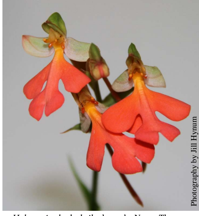
Habenaria rhodocheila shown by Nancy Thomas

Orchid Growers' Guild, October 2014 page 3 of 6