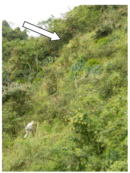
Jeff heading up the slope towards the 'yellow orchid'

Our second stop was for a flash of yellow on a hillside. I stayed on the far side of the road and observed as Jeff and Hugo scaled the steep slope to the patch of yellow which was indeed an orchid, an Odontoglossum halli var. sanctinum.