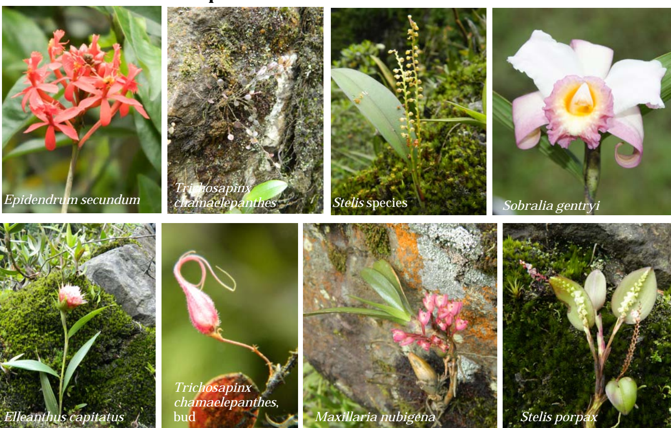
Orchid Growers' Guild October 2015, page 4 of 9