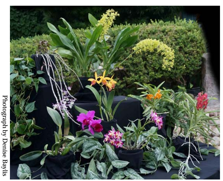
Another exhibit at WOS