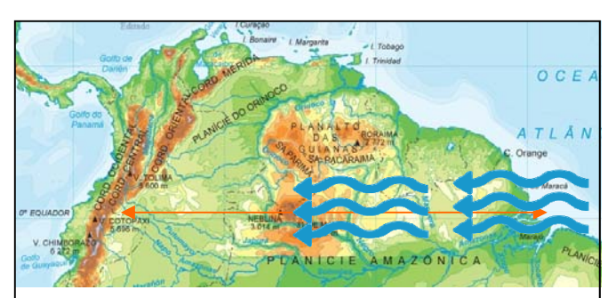
Warm moist air carried by the Easterlies from the Atlantic Ocean over the vast, relatively flat expanse of Brazil to precipitate on the eastern slopes of the Andes

Ecuador straddles the equator, thus its name. Elevations range from sea level on the Pacific