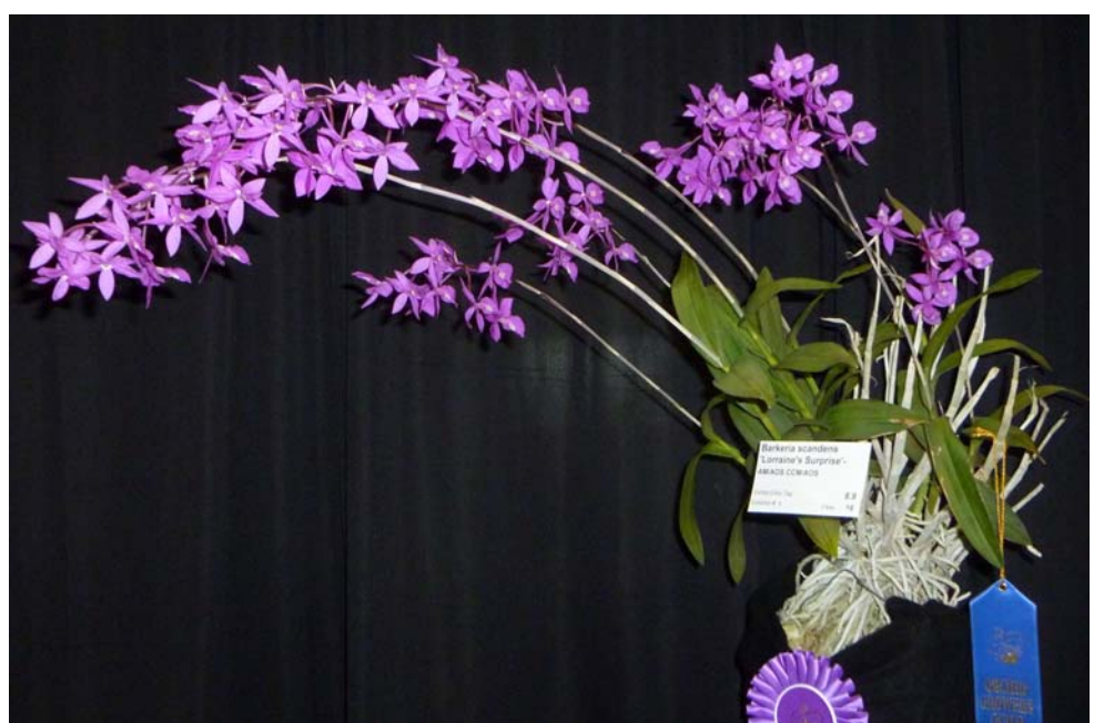
Barkeria scandens 'Lorraine's Surprise' AM/AOS, grown by Lorraine Herden from NEWOS