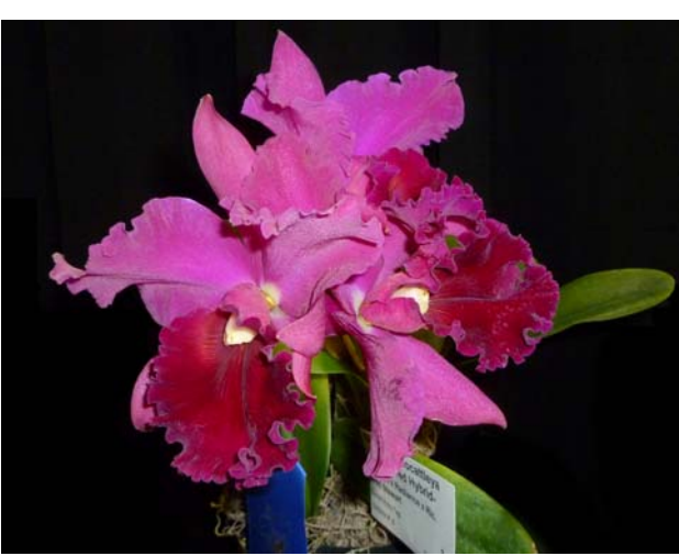
Rhyncholaeliocattleya grown by Natt's Orchids