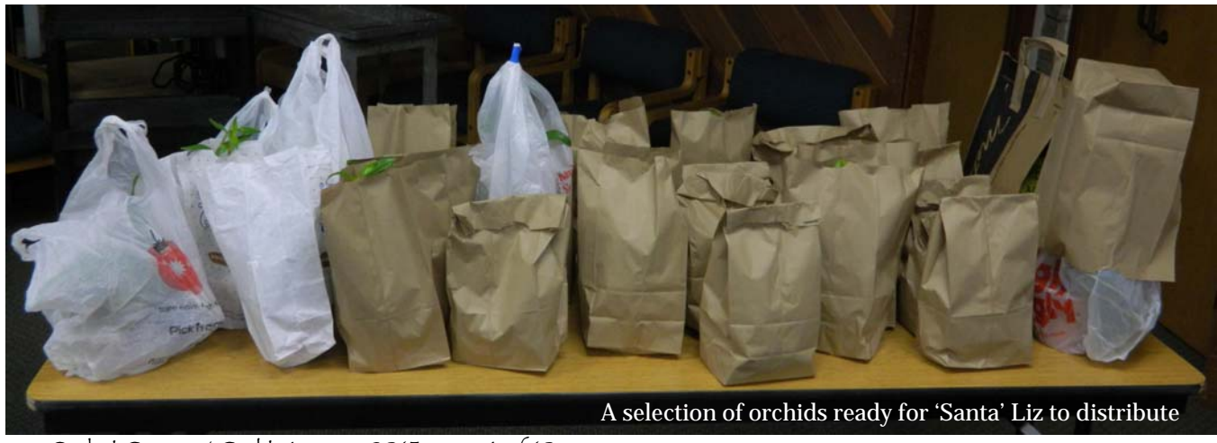
Orchid Growers' Guild, January 2015, page 4 of 10

It is time for someone else to take home the ribbons and exhibit awards! I think I will be available to help out but with limited time and energy to be heavily counted upon. You will find this exhausting but a lot of fun and a great opportunity to work with other OGG members. So please step forward and help out the Guild and your creative side!