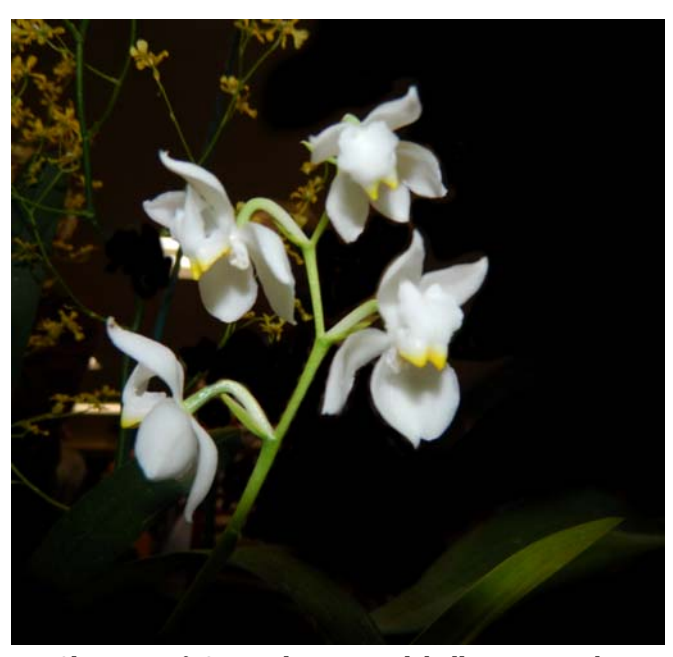
Close-up of Osmoglossum pulchellum , grown by Audrey Lucier