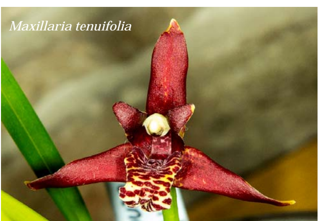
Orchid Growers' Guild June 2015, page 3 of 7