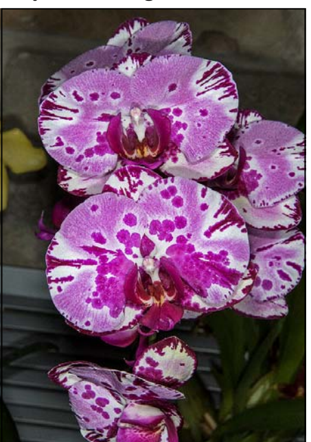
Doritaenopsis Ever Spring Prince Harlequin' ( Phalaenopsis Golden Peoker x Phalaenopsis Taisuco Beauty)

Sunday, May 31 we completed the move of our storage unit to its new location at Seybold Storage across from Woodman's