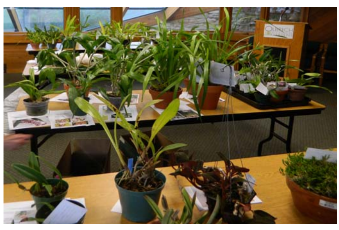
Some of the plants offered for bid at the member's Auction at the May meeting

Don't forget we need a new Orchid Quest Photographer and webmaster. Rich Narf will