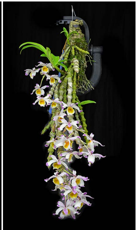
Dendrobium pendulum (syn. cassinode ), Olbrich Gardens, was awarded HCC/AOS