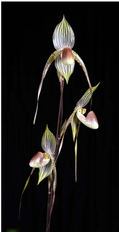
HCC/AOS Paph Predatious x rothschildianum , Orchid Inn