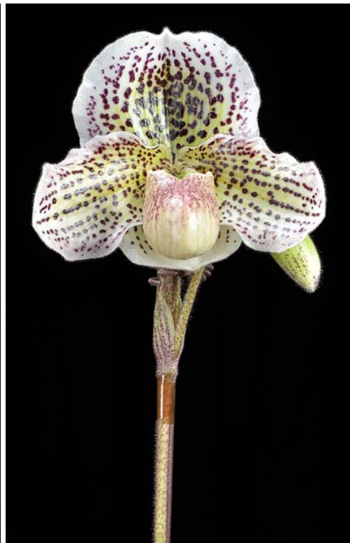
HCC/AOS Paph fairrieanum x Icy Galaxy, Orchid Inn