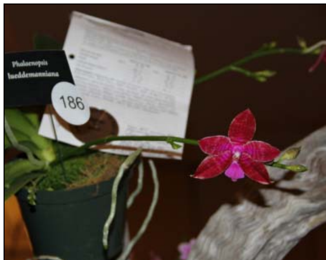
This Phalaenopsis lueddemanniana may only have one flower but it has an AOS award

He said that even MSU fertilizer has too much potassium. Originally, he tried to remedy the problem by cutting it with calcium nitrate and Epsom salts. Later he switched to a low potassium fertilizer called "Green Care". He said it's available from First Rays. He also mentioned that Orchidata potting mix doesn't hang on to potassium like some other mixes. He recommends getting a TDS meter so you can check the concentrations in your fertilizer. When asked for a formula for reducing the potassium, he said probably 1/8 tsp of MSU, 1/8 tsp calcium nitrate