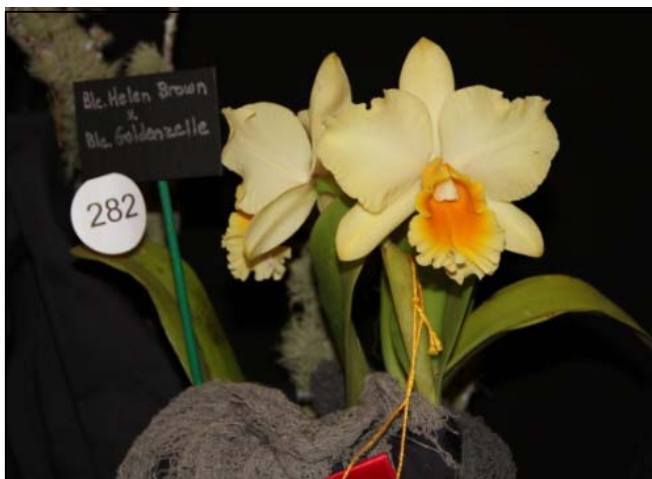
Blc Helen Brown x Blc Goldenzelle