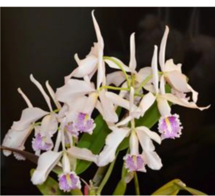
Cattleya maxima 'La Pedrena' SM/JOGA

...Since this meeting of the Congress was not associated with an orchid show, the leadership of the Congress requested a new American Orchid Society service of the personnel of the Chicago Judging Center, an "outreach judging". This is an event where official AOS judging takes place NOT at an orchid show, maybe at a meeting of a local orchid society. In this