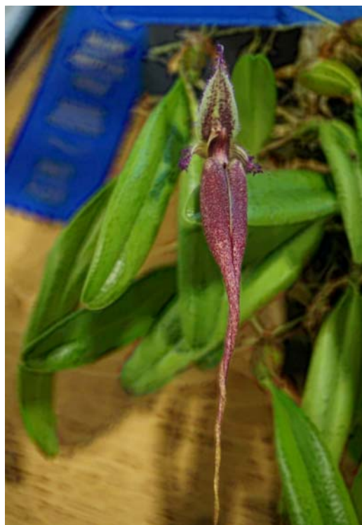
Bulbophyllum fascinator (species) [right] and Brassolaeliocattleya Chia Lin 'Shinsu #1'