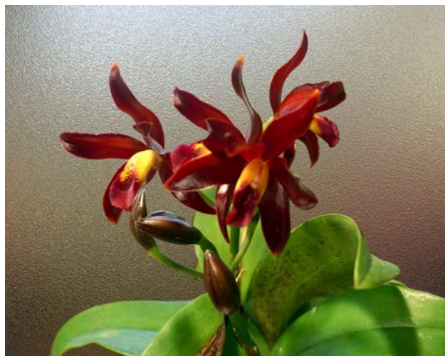
Cattlianthe Chocolate Drop 'Volcano Queen'

Orchid Growers' Guild January 2016, page 6 of 8