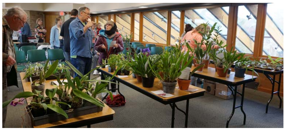
Checking out the auction offerings