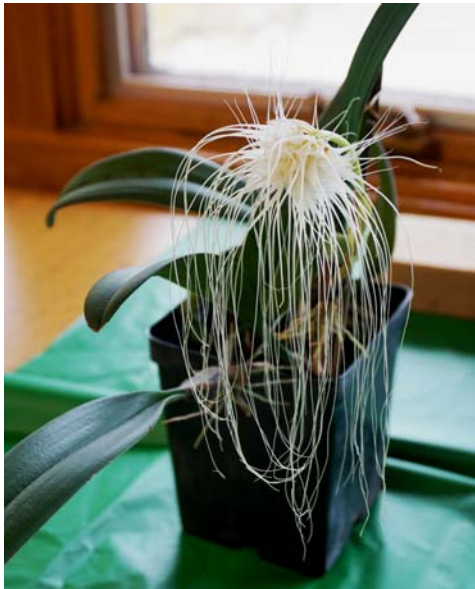
Bulbophyllum medusae (aka stinky)