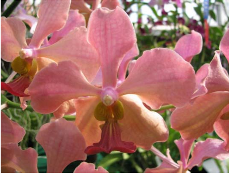
The Friends of Noelridge Gardens received an AOS award for culture as well as an AOS flower award for their Papiliovanda TMA with 58 flowers and 32 buds.