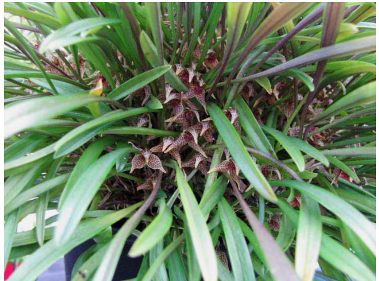
Clockwise from directly above: this Paph charlesworthii alba from Illowa Orchid Society's exhibit received an AM; the specimen-sized plant of a miniature species, Dryadella simula , that measured over a foot in width and 7 inches high with about 480 flowers and 55 buds. It was a perfectly grown round mound of foliage, from Orchids Limited. The Paph Shun-Fa Golden earned an AM for a member of The Greater Kansas City Orchid Society.