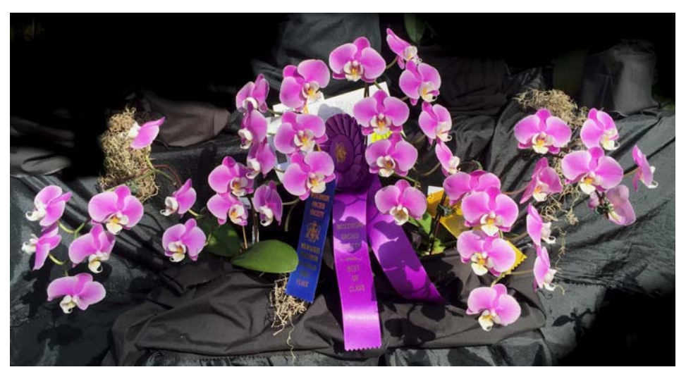
This stunning Phalaenopsis was in the Eastern Iowa Society exhibit

WISCONSIN ORCHID SOCIETY SHOW HIGH LIGHTS