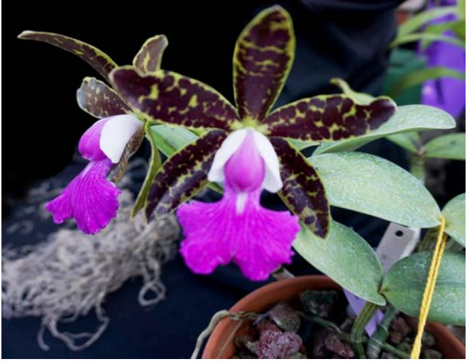
Cattleya Pradit Spot 'Isabel's Delight' (C Thospol Spot x C schilleriana ) AM 82 points; Natt's Orchids