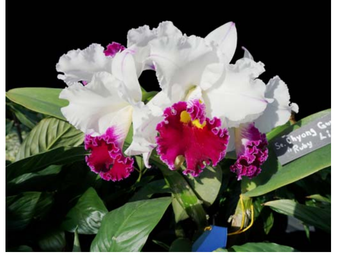
Lc. Chyong Guu Swan 'Ruby Lip' AM/OSROC (Lc. Wayndora x Persepolis); B&H Orchids