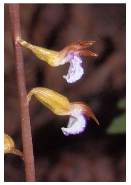
The smallest orchid growing wild on our land, the autumn coral root ( Corallorhiza odontorhiza ). This species lacks chlorophyll and lives off decaying wood and fungi. The flower lips are only a few millimeters long. They rarely look this conspicuous. Sauk County.