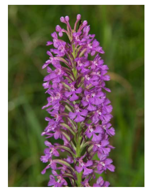
The largest orchid on our farm, the purple fringed orchid ( Platanthera psycodes ). This species blooms in mid to late July. Like many of our orchids, individuals are short-lived (one to four years as a blooming plant, we don't know how long from germination to blooming size.) Plants can be from one to four feet tall. Each floret is only about a half inch wide. Sauk County.