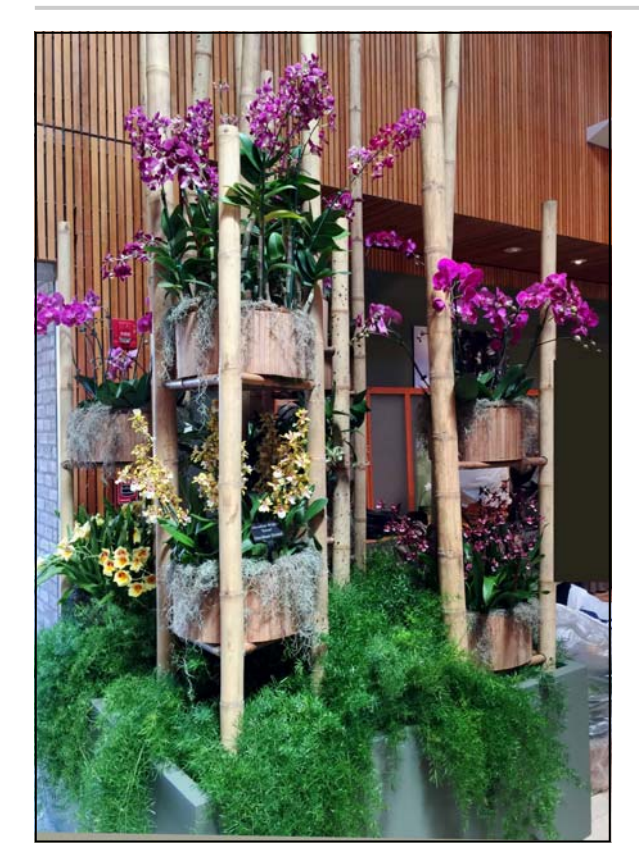
Above and right: some of the Chicago Botanical Garden orchid displays in public areas in celebration of their annual Orchid Show fundraiser

Terri Jozwiak Cattl. Iwanagara Apple Blossom