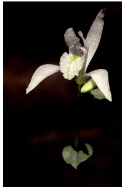
The very cryptic three birds orchid, Triphora trianthophora . Another native of the Baraboo Hills, this species blooms for only a day at a time in late summer. The landowner adjacent to this population found one blooming with a house plant in a pot inside his front door, yet another contradiction to the widely held belief that all native orchids need special soil. Flower about ¾ inch wide. Sauk County.