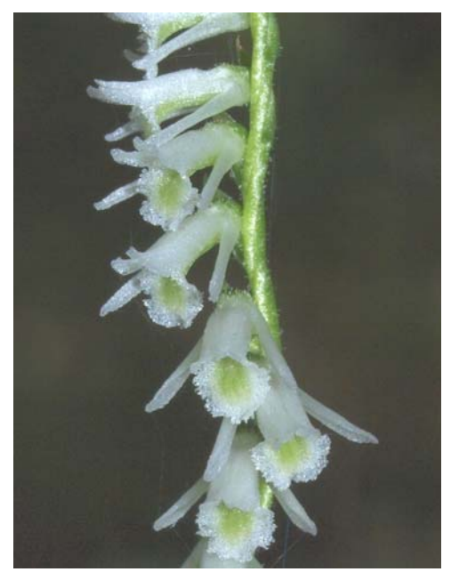
The ladies' tresses orchids (7 total species in Wisconsin) are small orchids with tiny, iridescent flowers. This species, photographed in Door County in late August, is the smallest, Spiranthes lacera , the slender ladies' tresses orchid.