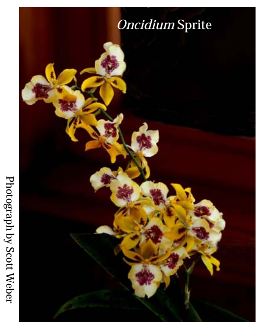
Orchid Growers' Guild April 2017, page 6 of 8