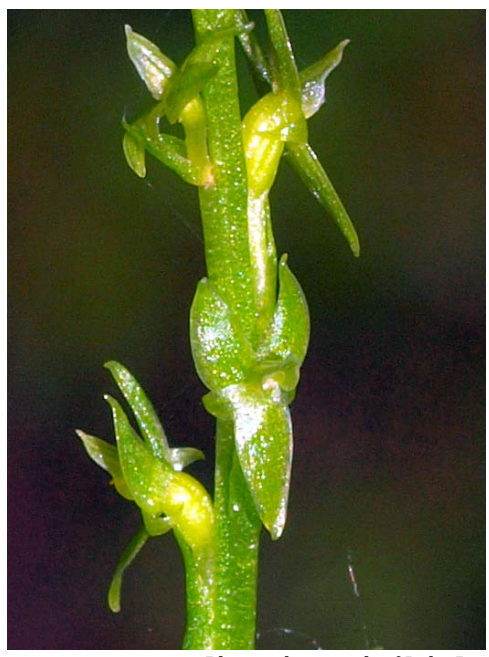
Photo taken north of Lake Itasca, MN. Bog adder's mouth, Malaxis paludosa . With flower petals only 2 to 3 millimeters long, this northern Minnesota species gets the prize for the most inconspicuous orchid in our region, not only for its size but color. Plants themselves are only about four inches tall. Novices will need a guide to find this one.

Although we associate orchids with sphagnum