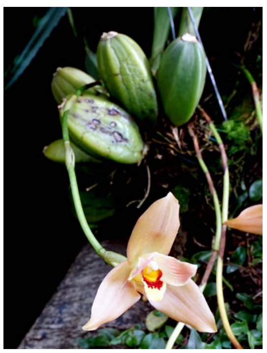
This Lycaste acquila 'Détente' was blooming in the Bolz Conservatory last month