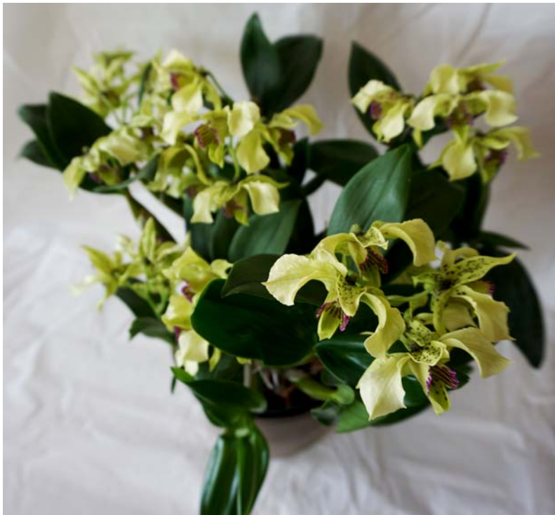
Dendrobium Little Pam (normanbyense x eximium)