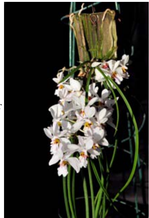
Holcoglossum mounted by Keith Nelson