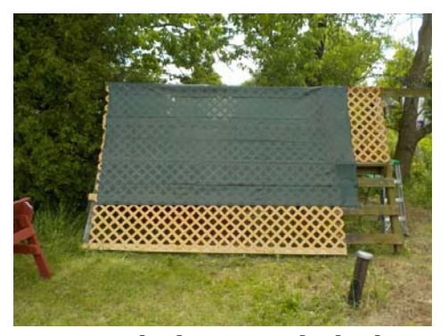
Cover the lattice with shade cloth. At first I thought the shade cloth might be too heavy, but after seeing the intense afternoon sun think it is appropriate.