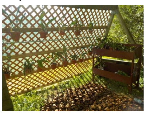
The shade house with plants installed. The shelf on the frame was used for smaller plants in secure trays.