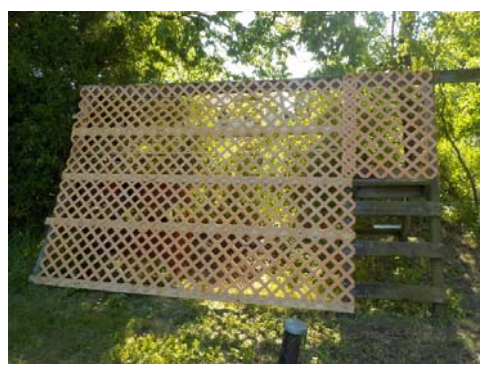
Take one unused wood frame swing set. Cover it with lattice. This swing set is facing west. I covered the west and south facing sides. A tree on the north side provides shade.