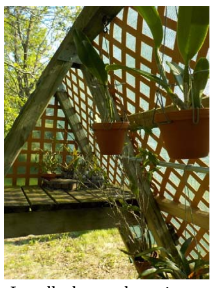
Install a heavy-duty pipe to hold plants. The rings on the top bar which used to hold swings are perfect for hanging plants.