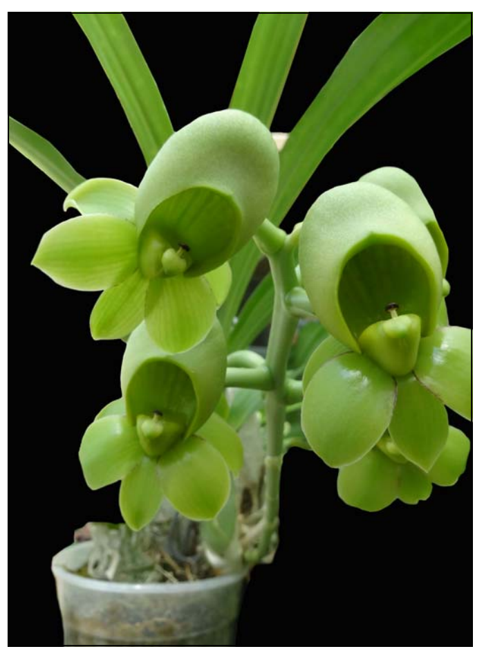
The "green" [female] version appeared May 25, 2017, when it bloomed again.

many species with at least 12 to 15 different basic shapes. The early confusion among the varying sexual and floral forms led to the de-