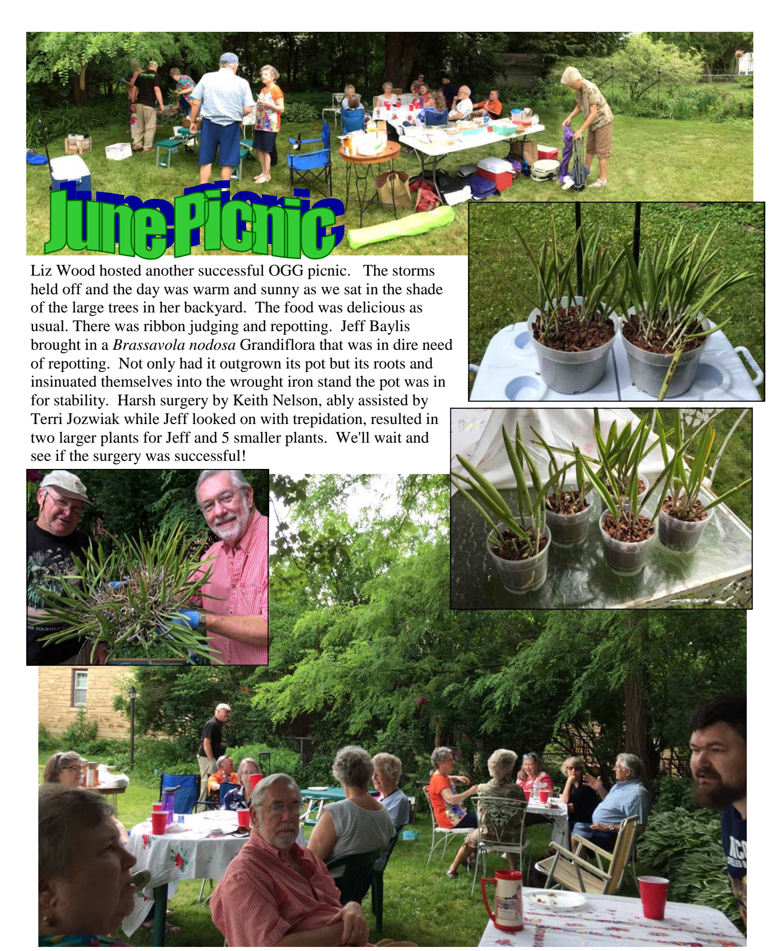
Orchid Growers' Guild September 2017, page 3 of 8