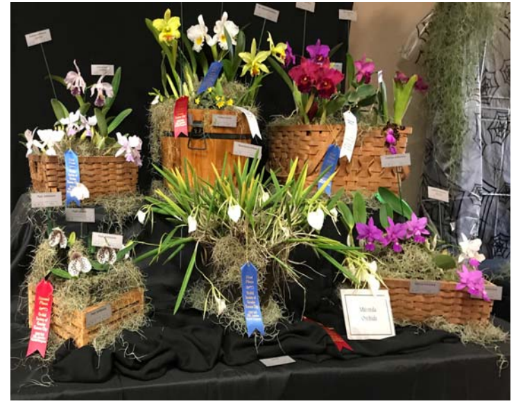
Orchid Growers' Guild December 2018, page 6 of 8