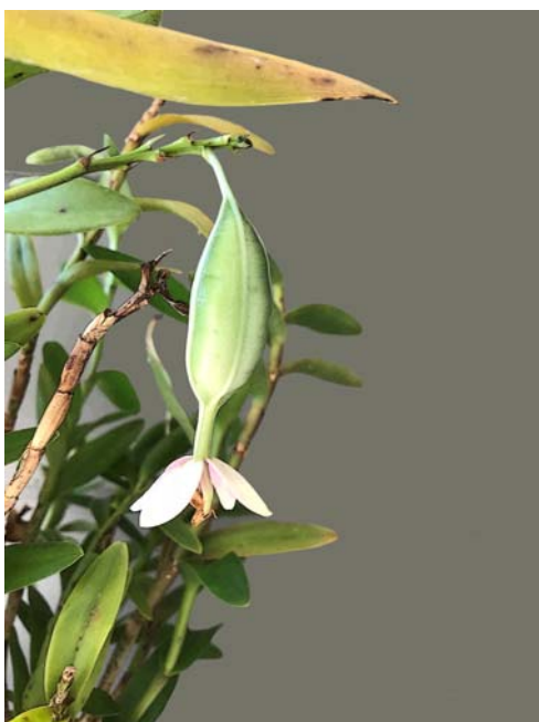
From Meg McLaughlin "Look what happened on my front porch when I wasn't looking. It's an Epidendrum Pink Vision pod! "