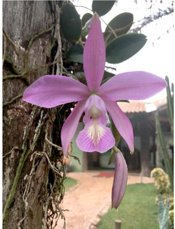
Cattleya nobilior , Found at Buraco das Arras in the south Pantanal near Jardim, but also seen in the north at SouthWild.

We spent four nights on a boat (called a