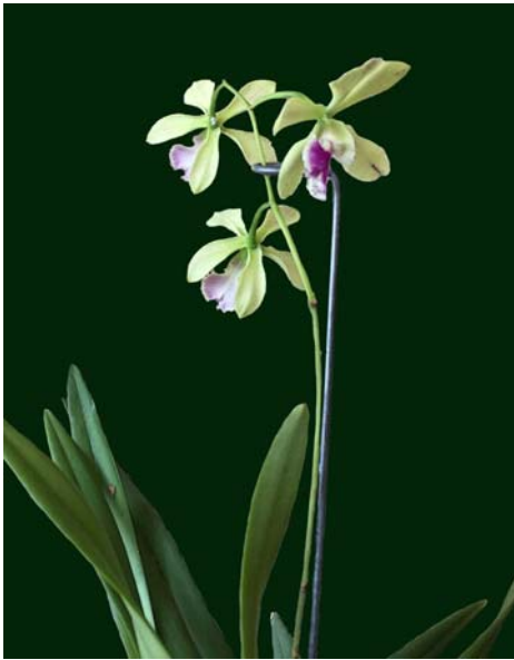
Epicattleya (now Catyclia ) Leaf Hopper (El Hatillo x tampensis v. alba )