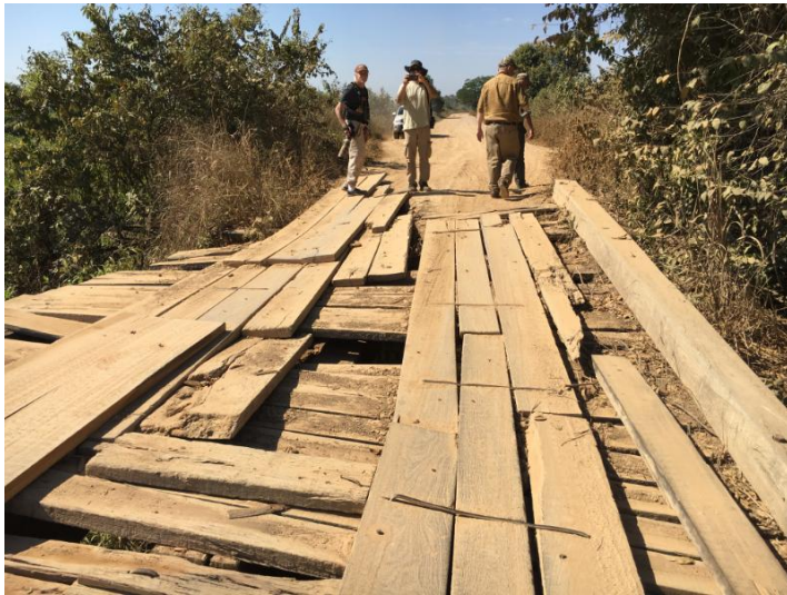
Broken down bridge along the Transpantaneira "highway"

In late July (Brazil's winter) we travelled to this unique place by flying to Cuiaba, Brazil, driving into the only portions of the northern half accessible by road, and then flying in a small plane to Jardim, near Campo Grande in the southern state. The Pantanal was wonderful for wildlife. It's renowned as the premier spot to see jaguars. We didn't have many opportunities to look