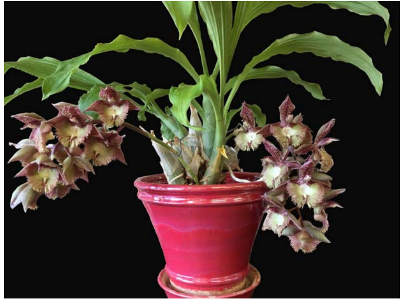
Catasetum 'Frisly Doris' (Doris's Choice x Dona Marie)