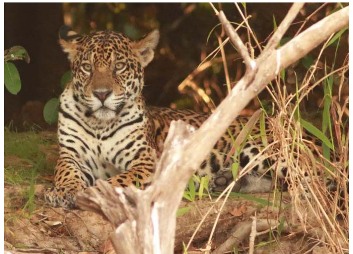
Jaguar