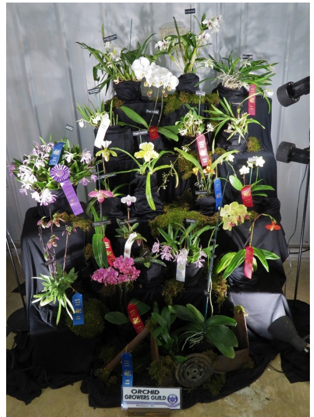
OGG Exhibit at Batavia