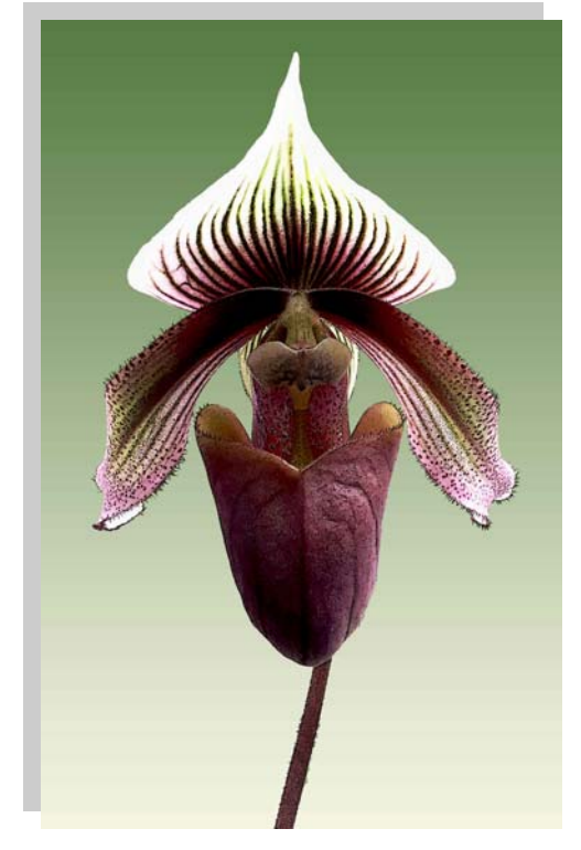
Paphiopedilum superbiens grown by Keith Nelson