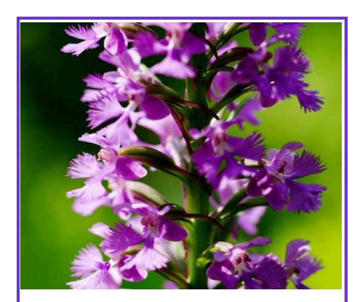
THE QUEST OF THE PURPLE-FRINGED Robert Frost

I felt the chill of the meadow underfoot, But the sun overhead; And snatches of verse and song of scenes like this I sung or said.