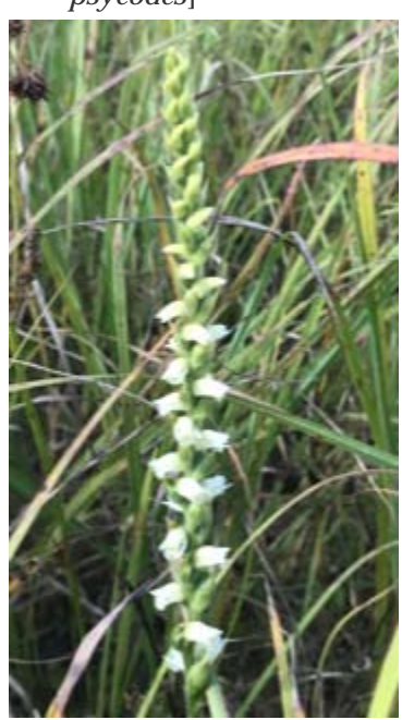
Case's Ladies' Tresses [Spiranthes casei]