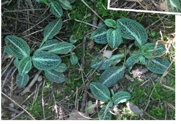
Orchid Growers' Guild September 2019 page 6 of 8