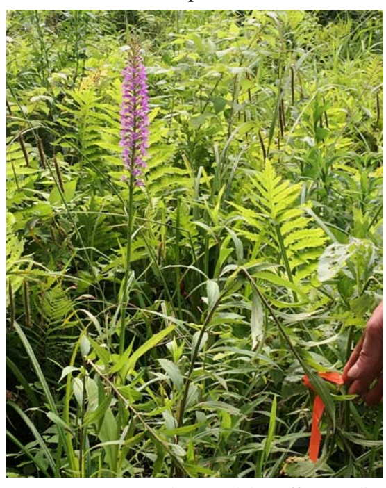
Lesser purple fringed orchid [ Platanthera psycodes]

With this success under our belts, we decided that rather than quit we would continue on and see what we could see, so up another big hill with the consolation that it would then be downhill all the way back to our vehicles. At the top of the hill we found