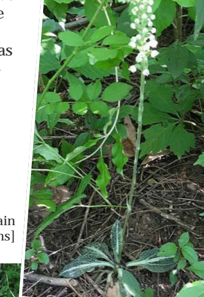
Downy rattlesnake plantain orchid [Goodyera pubescens]

ephemeral. They will grow where they find suitable available habitat which is often along the edges of mown areas such as trails and the gas line right-of-way. Considering that there are only 10 species of orchids on this property we did pretty well!