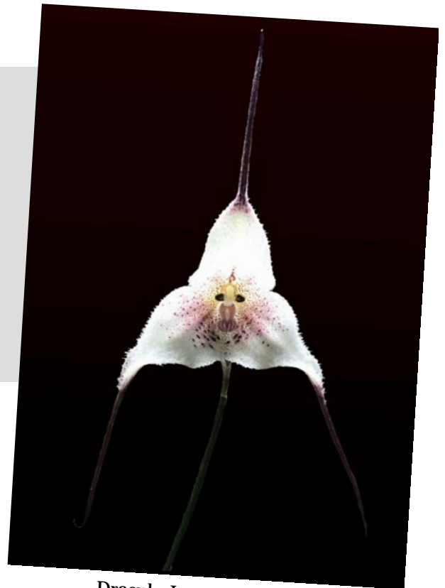
Dracula Jester 'Sherwood' (platycrater x lotax)