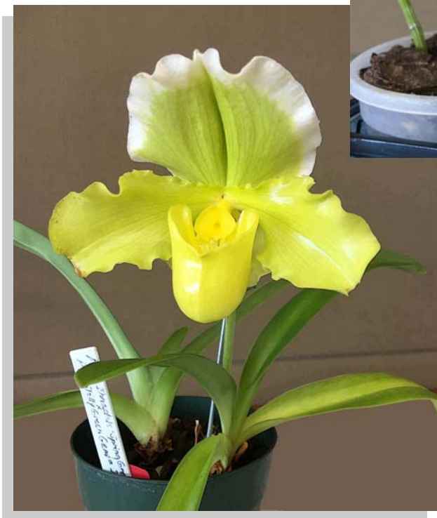
Paph Innadale 'Spring Green' (Divisadero x Mariano Martin)