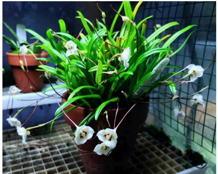
Dracula lotax from Sue Reed's orchidarium

Draculas are often clustered in areas at the top of mountains. An important area is Reserva los Cedros which consists of 17,000 acres of pre-montane wet tropical forest and cloud forest. See reservaloscedros.org . It is 60 kilometers northwest of Quito. An all day trip by bus, truck, and mule is required to reach the preserve. It is part of the Choco Phytogeographical Zone, one of the most biologically diverse and endemic habitats on earth. An extensive trail system has been developed but most of the 17,000 acres remain untracked and rarely visited by humans. Many Draculas grow in only very small places. Some seem to grow only on fallen logs. New species are continually being discovered. It is becoming increasingly difficult