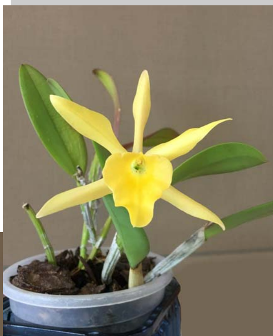
Bc Daffodil ( Brassavola glauca x C. aurantiaca )