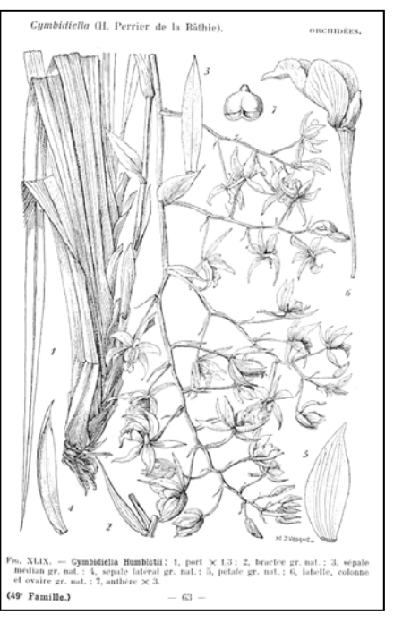
Cymbidiella falcigera (Rchb.f.) Garay [as Cymbidiella humblotii (Rolfe) Rolfe], Flore de Madagascar et des Comores, Orchidées, vol. 49(2): Orchidées, p. 63 (1941) [M.J. Vesque]

I cut the plastic pot apart. Inside the pot was a tight ball of soggy sphagnum moss