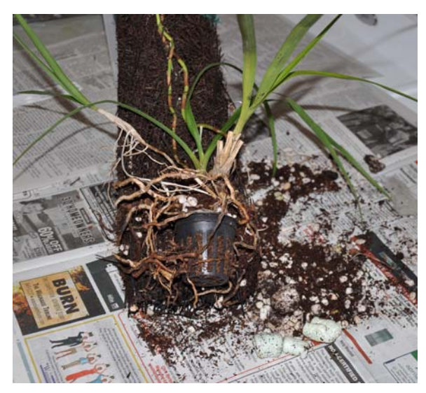
Figure 1 Orchid Growers' Guild January 2019 page 8 of 9

The medium looked like some type of terrestrial mix with a few Styrofoam peanuts. Fig. 1. Figure 1 also shows a surprise, there was a little