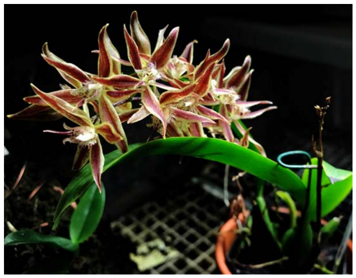
{\bf \it Macradenia\ multiflora}

so we don't duplicate our efforts. OGG is a 501(c) nonprofit organization, donations can be deducted for tax purposes.