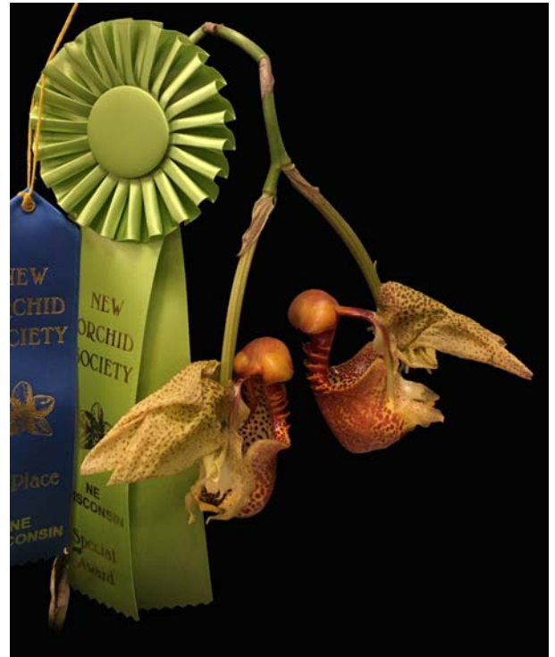
Show Chair Award to went to this Coryanthus micrantha