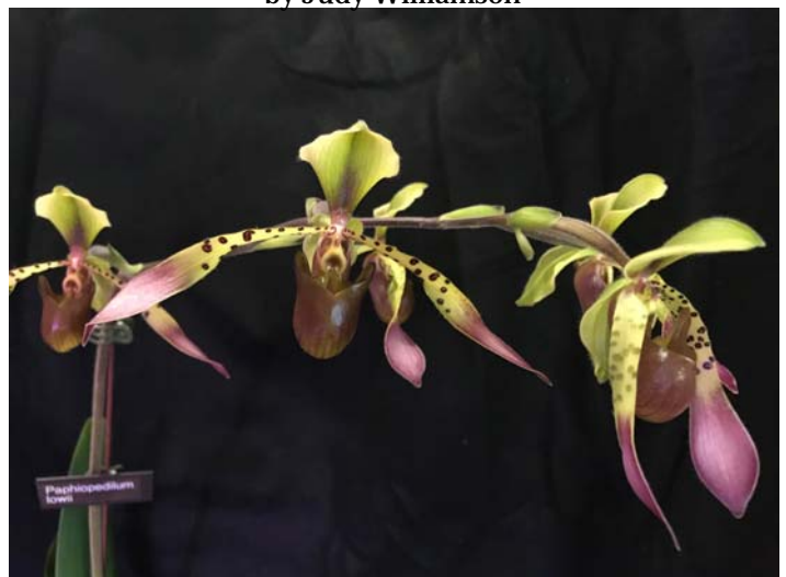
Paphiopedilum lowii