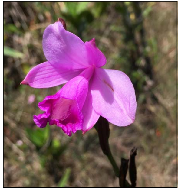
Possibly a Bletia

Political regions were set up by the location of different tribes and their villages. The vast majority of the population lives on the coast and have never been to the interior (which is where we spent most of our time). We met the vice president of the country (who happened to be the father of our bird guide) campaigning at one of the villages we stayed in. We saw only one blooming orchid (attached), on the Guianan Shield near Kaieteur Falls ( https://en.wikipedia.org/wiki/Guiana_Shield ), a huge stone ridge that spans Guyana and neighboring countries. The local guide called it "Rosa Lindali" but it looks like an orchid to me-- although I can't find it in a Google image search. I saw orchid leaves on high tree limbs when we did a canopy walk, but no flowers. Birds were beautiful and different but often far away (first time to see a Harpy Eagle, Cock of the Rock, and Hoatzin).