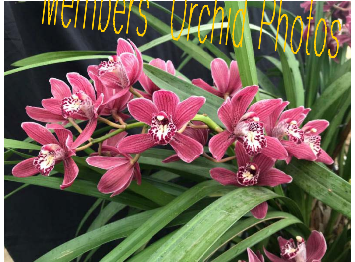
Cymbidium pipeta