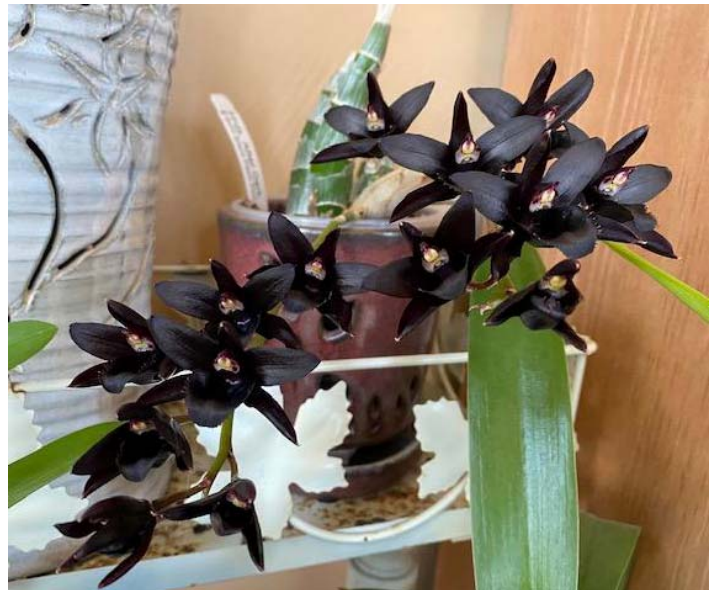
Fredclarkea After Dark SVO 'Black Pearls'