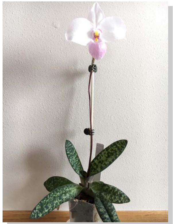
Paphiopedilum delenatii