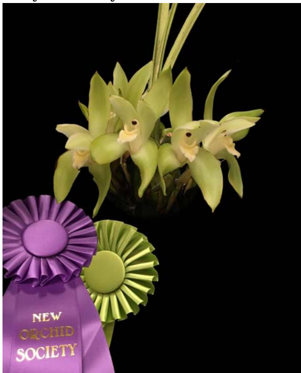
Sudamerlycaste barrowiorum 'Baby Totz' from Big Oak Orchids, earned an Award of Merit 83 and Botanical Recognition