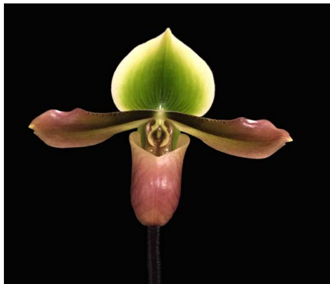
Paphiopedilum mastersianum Deerwood, Award of Merit with 83 points