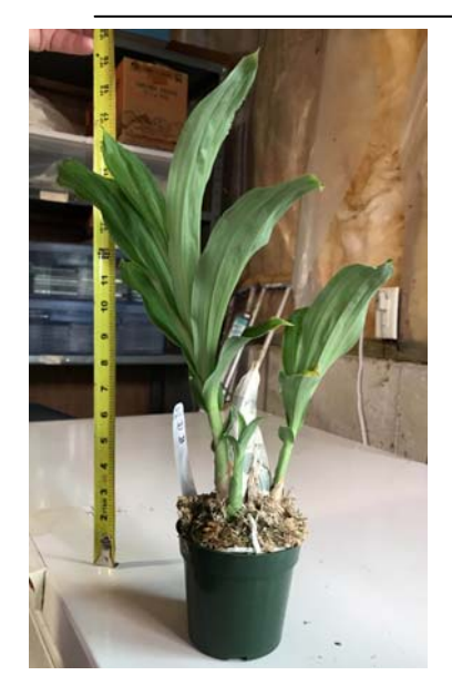
Pic 1. This plant was grown under full-spectrum LED lights. Three growths. WOW!

Several participants responded to my request, published in June newsletter, for photos of their respective project plant. The following pictures are from these folks. Again, the cross is Ctsm. NEW HYBRID (<a href="Ctsm. fim-briatum">Ctsm. fim-briatum</a> 'Golden Horizon' x Ctsm. osculatum 'SVO').