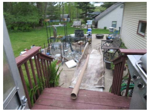
Shelves and other paraphernalia when outside onto the porch.