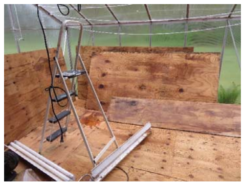
We took the plywood out of the greenhouse and then let the subflooring of 2 layers of styrofoam dry. After the plywood was dry it was laid back down. The plywood pieces had grown a little while they were drying so they had to be trimmed again.

We picked out a linoleum at Menards online (and because of Covid) and we sent our son to the store.