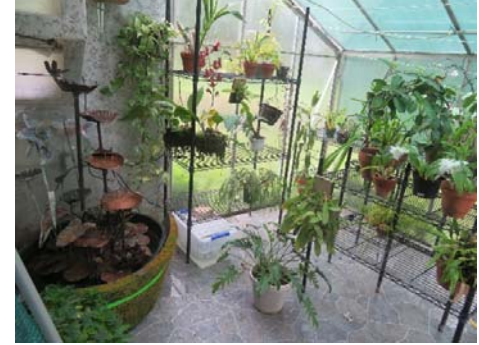
We put back all the plants and other assorted greenhouse supplies.

Right picture shows the normal greenhouse and the left shows when the fogger worked too well!