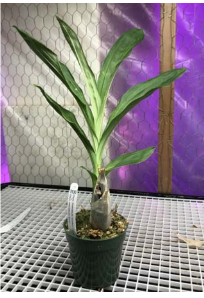
Pic 2. Plant was grown under T5 lights (Blue and Red) located near a large window with a highly-shaded southern expo-