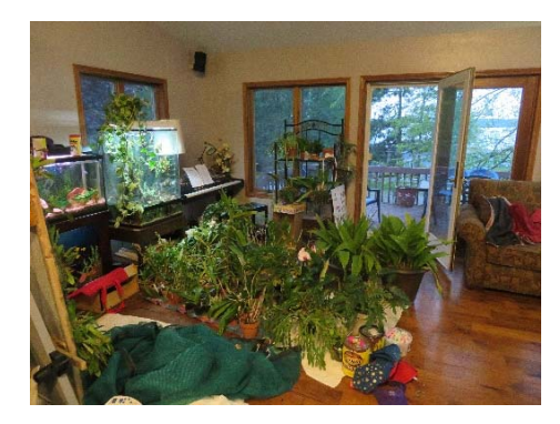
The plants went into the living room on the floor.