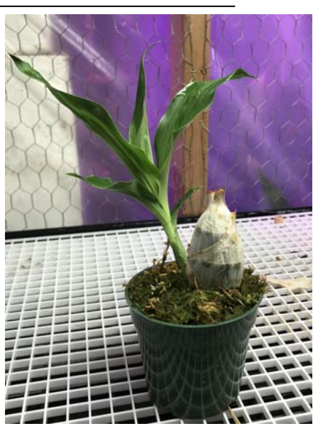
Pic 3. Notice the large ovoidshaped mother pseudobulb for this plant of the cross.