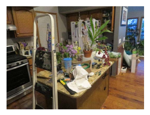
First we removed everything from the greenhouse. Weather was supposed to be cold and rainy so electricals and live material came inside

While cleaning my greenhouse I noticed a huge hole in the linoleum floor. This meant that the water, that was supposed to go down the drain in the floor (and go right outside), now was leaking onto the subflooring. Knowing that that was plywood I knew that it had to be replaced. Little did I know the work this was going to entail