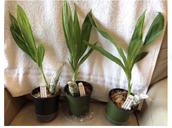
Pic 4. This grower purchased two additional plants of the cross to observe the differences that can occur within a single cross.