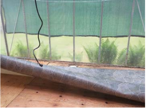
Then the linoleum was laid out. We are not carpenters or experienced floor people so we picked a single piece of linoleum.