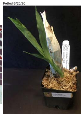
Pic 6. This plant was repotted recently.

I wish to thank all of you who submitted photos of your catasetum. Your photos are evidence that you are doing a great job at growing your plant. We look forward to seeing the blooms!