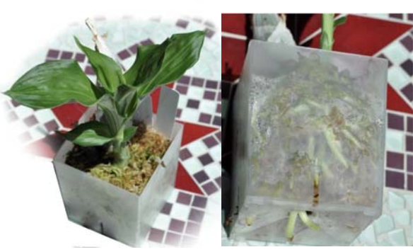
Pic 5. Notice the thick substance of leaves and the proliferation of very healthy roots.