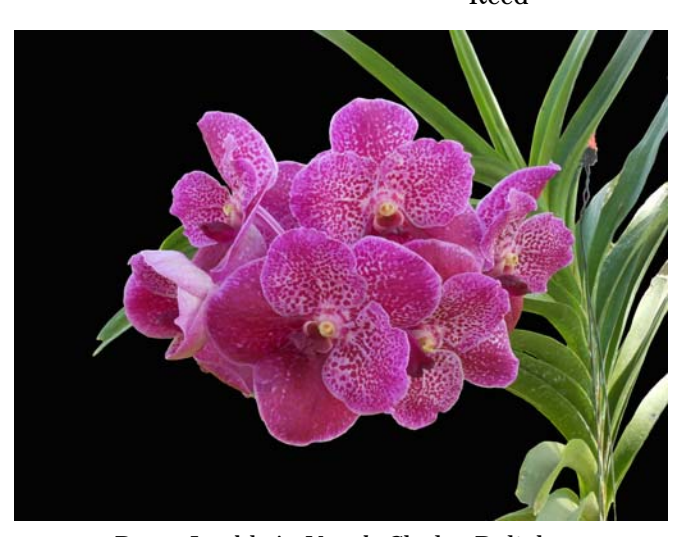
Bruce Luebke's Vanda Chulee Delight

Orchid Growers' Guild July 2020 page 4 of 10