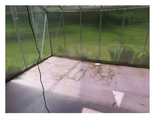
The old linoleum was taken up and as expected the wood was soaked. We (my husband & son) pulled up the plywood sheets, two layers, and set them up to try to dry. This took all week because it was raining outside for a few days.

We picked out a linoleum at Menards online (and because of Covid) and we sent our son to the store.