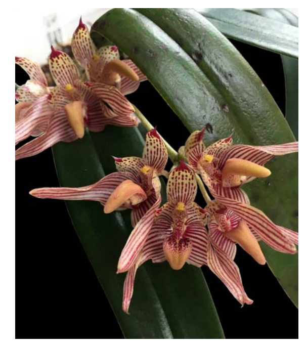
Nancy Thomas' Bulbophyllum bicolor

Orchid Growers' Guild July 2020 page 4 of 10