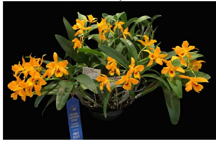
Ctt. Gold Digger 'Buttercup' (Ctt. Red Gold x Ctt. Warpaint) grown by Lois Duisdiker won first place Orchid Growers' Guild March 2020 page 5 of 9