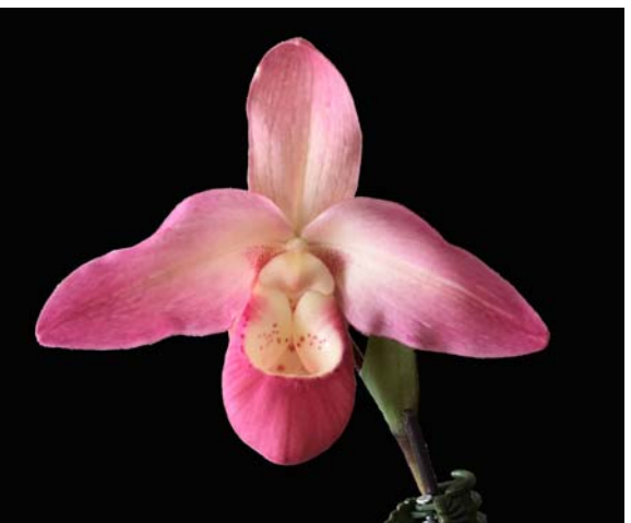
Phragmipedium Peruflora's Spirit (Eric Young x kovachii 'Warbird')