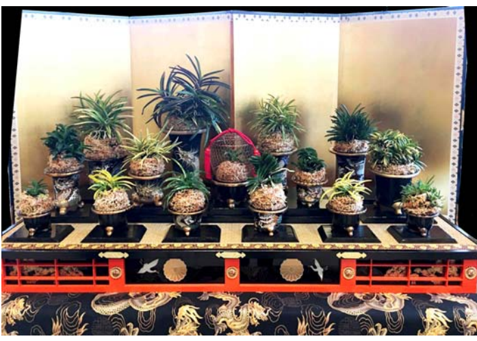
Ken Cameron's educational exhibit 'Samurai Orchids' won First place and Best of Class