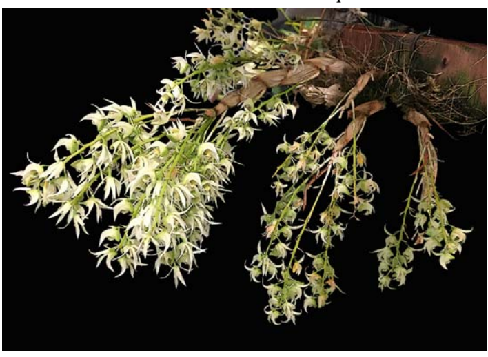
Dendrobium strongylanthum grown by Walter Crawford won second place