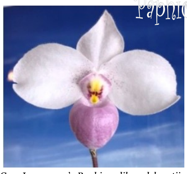
Gary Lensmeyer's Paphiopedilum delenatii . "Fragrant flower that is long lasting, 8+ weeks."