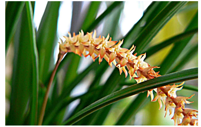
Sandy Delamater's Dendrochilum banksii . "From the Philippines. First blooming, one spike."