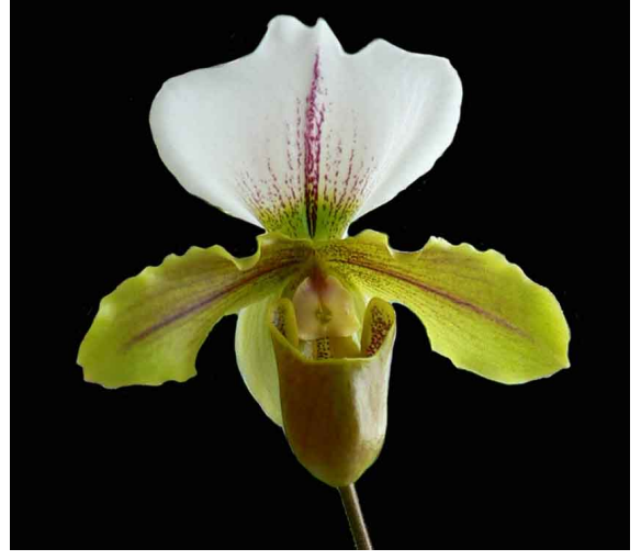
Sandy Delamater's Paphiopedilum spicerianum x Stone Lovely. "I bought this at last OGG auction. My first blooming. Flower is 4 in. x 4 in."