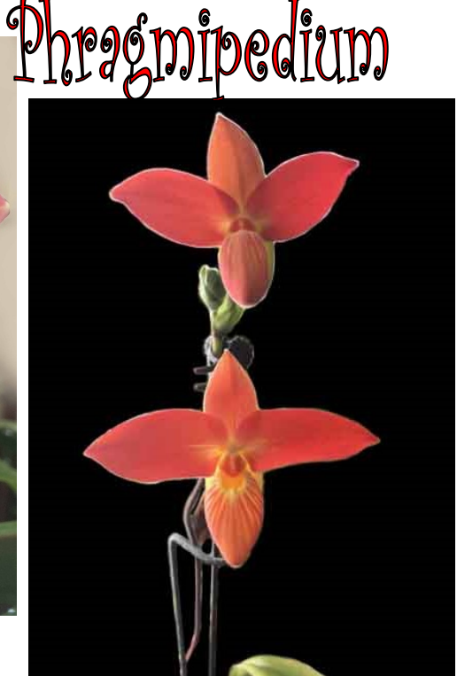
Susan Reed's Phragmipedium besseae. "From Fox Valley about 5 years ago. Took several years for it to bloom for me. The upper flower is just opening up. Having two flowers lasted quite awhile. Grow this cool with Eastern Exposure in the sun porch, so cool in winter and on warm/hot side in the summer."