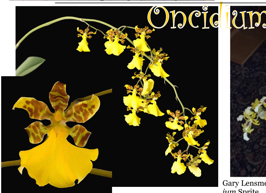
Jeff Baylis' Oncidium splendidum.

Orchid Growers' Guild April 2021 page 7 of 15