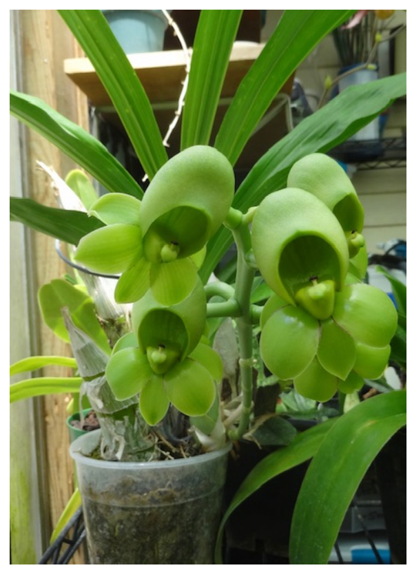
Female flowers another year when temperature was cold and humidity was low in the growing area.

At left: My catasetum collection is waiting for the right conditions to renew itself through the production of new shoots. Two of the plants show the beginning of new shoots.