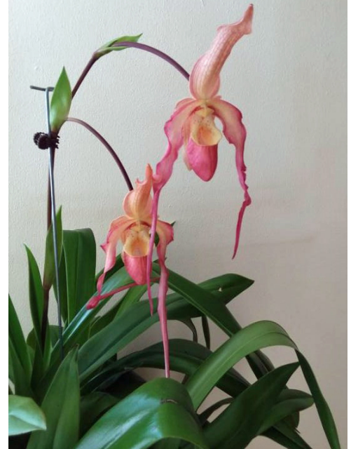
Lori O'Neill's Phragmipedium Belle Hougue Point (Eric Young x caudatum ). "Purchased at Acker's in 2004. Second spike bloom this winter."