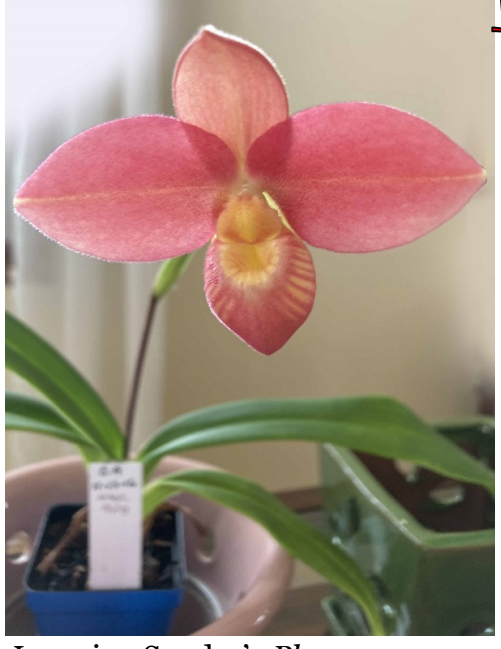
Lorraine Snyder's Phrag-mipedium St. Ouen Flava Hanne Popow (4N) AM/RHS x Phrag-mipedium besseae v flavum 'Chucks Choice'). "Purchased at Hausermann's Chicagoland 9/19 as a seedling. First bloom."