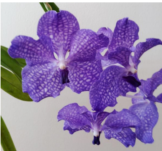
Lori O'Neill's Vanda Sansai Blue 'Ackers Pride' FCC/AOS (Crimson Glory x coerulea ). "Purchased at Acker's in 2015."