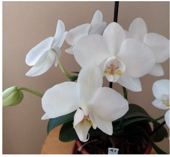
Lori O'Neill's Phalaenopsis unknown hybrid

Orchid Growers' Guild April 2021 page 12 of 15