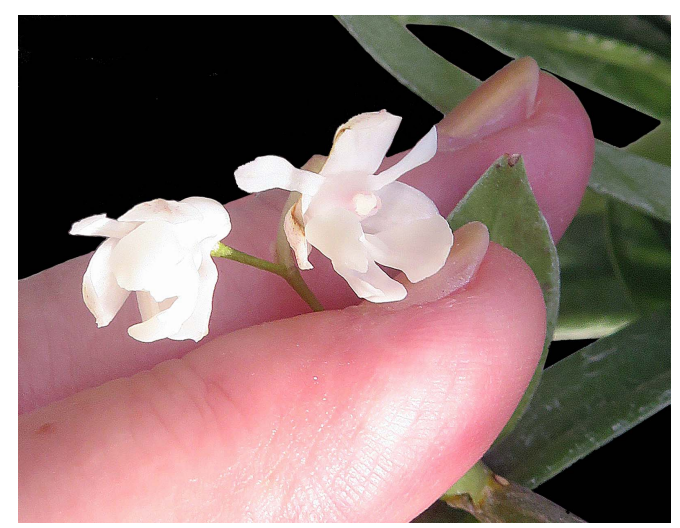
Terri Jozwiak's Dendrobium aberrans x sib. "It has bloomed before but doesn't actually open the white bud too often."