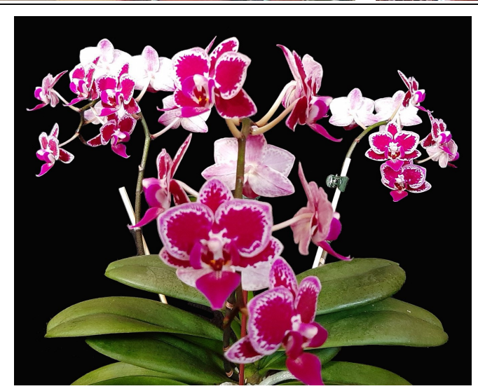
Lynn West's Phalaenopsis mini unknown hybrid