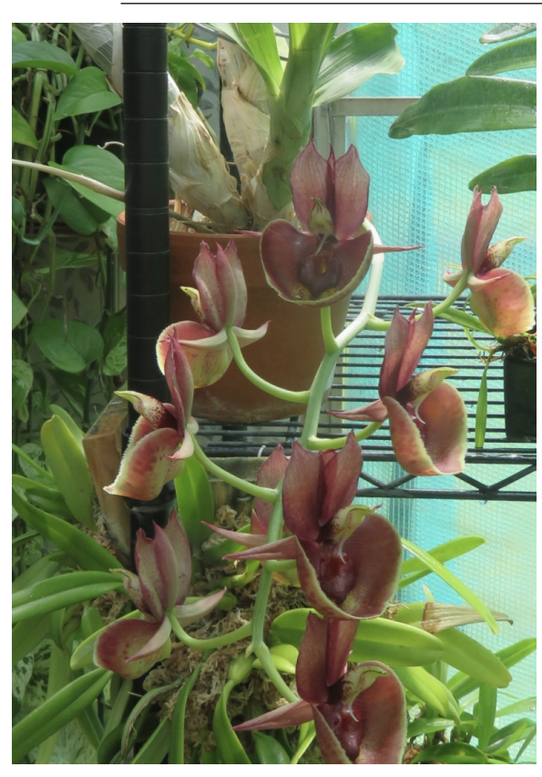
Male flowers one year.