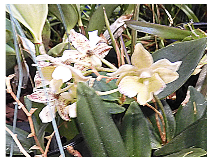
Cynthia Wadsworth's Dendrobium Micro Chip ( aberrans x atroviolaceum )