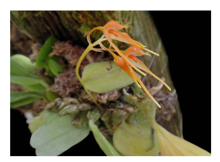
Terri Jozwiak's Bulbophyllum taiwanense . "It's a tiny little thing mounted on a board with feather like flowers."