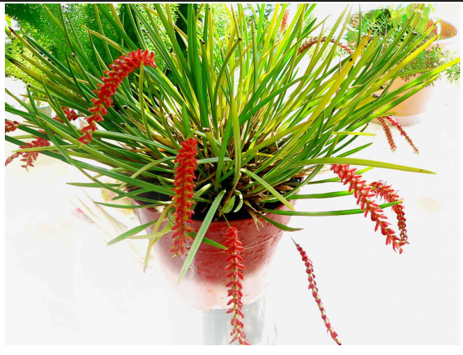
Sandy Delamater's Dendrochilum saccolabium "Unusual plant from the Philippines, not often seen. Bought in Florida around 2014. Best flowering this year with 16 spikes, each with around 40 flowers."