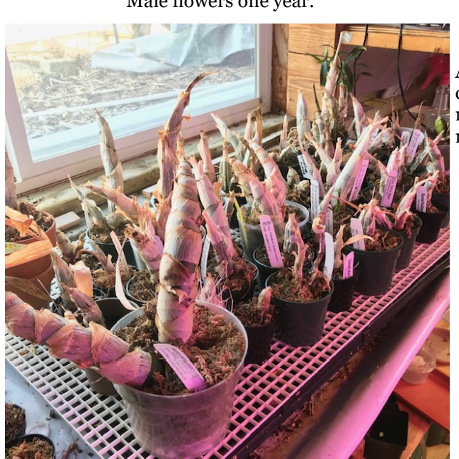
Orchid Growers' Guild April 2021 page 3 of 15