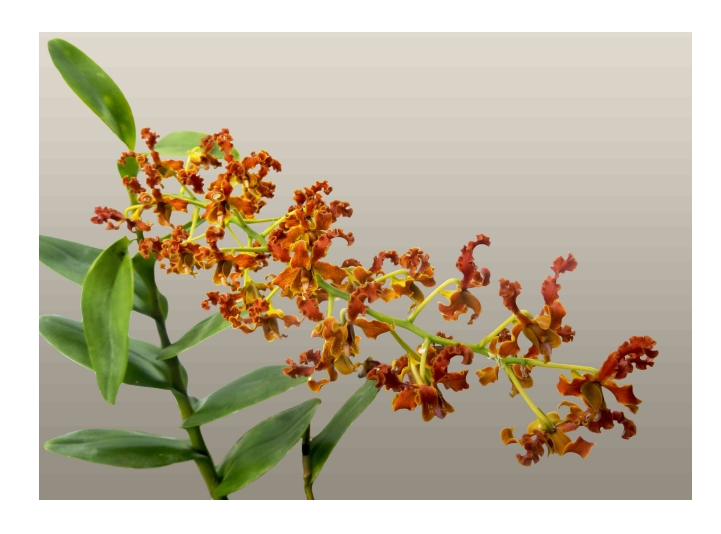
Terri Jozwiak's Dendrobium discolor . "This was blooming last month but now all of the flowers are open."