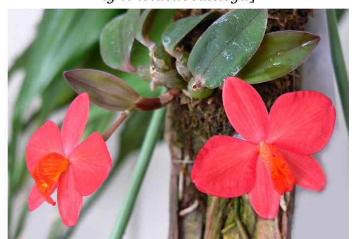
Sandy Delamater's Sophronitis mantiqueirae . Each flower is 1 ½ x 1 ½ in. Mounted on a 5 in. stick. Orchid Growers' Guild April 2021 page 14 of 15