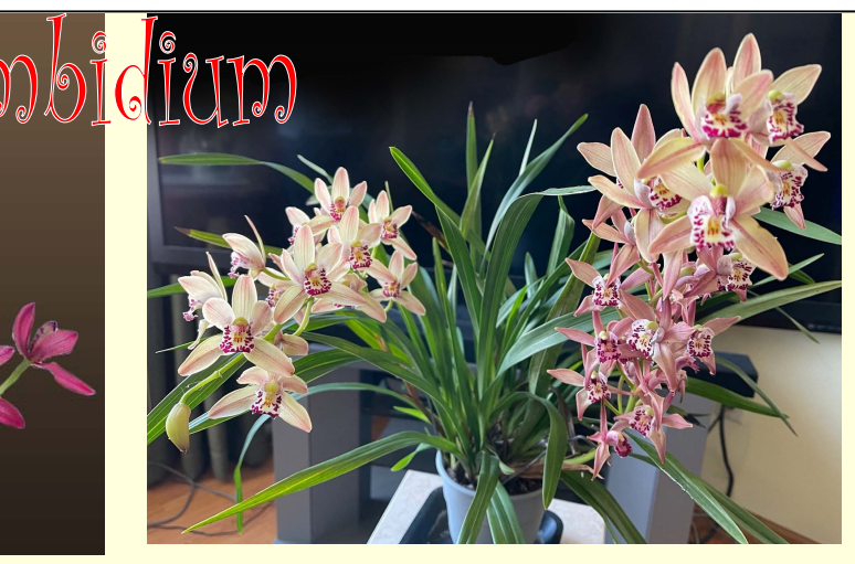
Doug Dowling's Cymbidium Skippy 'Koharubiyon' (October x floribundum )