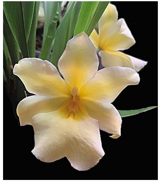
Susan Reed's Miltoniopsis roezlii var xanthina . "Very fragrant species with a few flowers per spike. Second spike is starting. Growing close to the floor in the basement so cool and with three of the medium sized fluorescent bulbs without seasonal variation in artificial lighting."

Orchid Growers' Guild April 2021 page 15 of 15