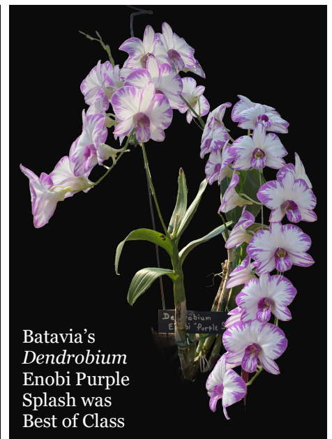
Batavia's Dendrobium Enobi Purple Splash was Best of Class