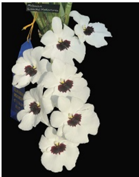
Miltonia Lillian Nakamoto