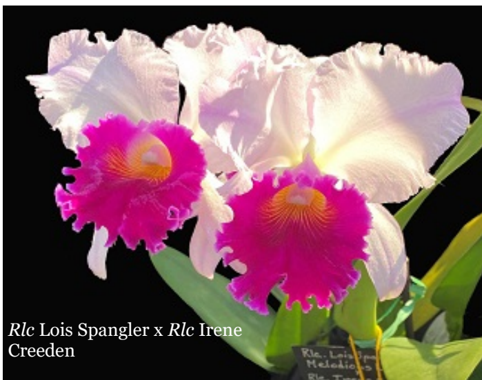
Rlc Lois Spangler x Rlc Irene Creeden

The Orchid Grower October 2021 page 4 of 7