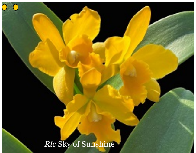
Rlc Sky of Sunshine