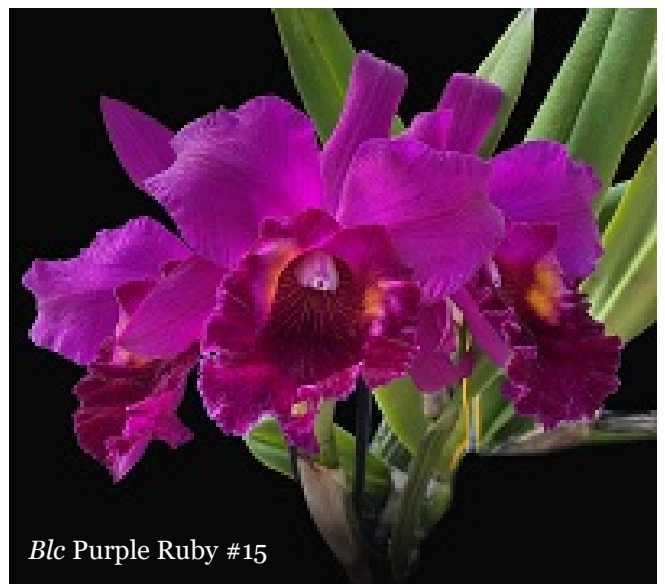
Blc Purple Ruby #15

The Orchid Grower October 2021 page 4 of 7