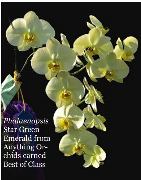
Phalaenopsis Star Green Emerald from Anything Or- chids earned Best of Class