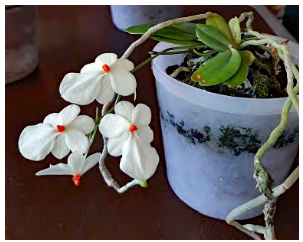
Aerangis luteoalba var. rhodosticta