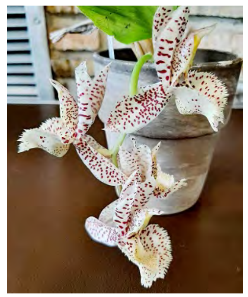
Catasetum Susan Fuchs x Ctsm Dentigrianum