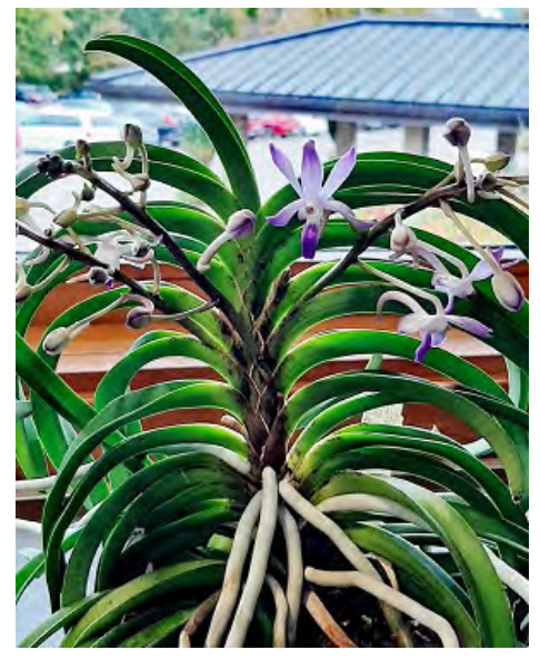
Meg McLaughlin's Darwinara Charm 'Blue Star' x Neofinetia falcata