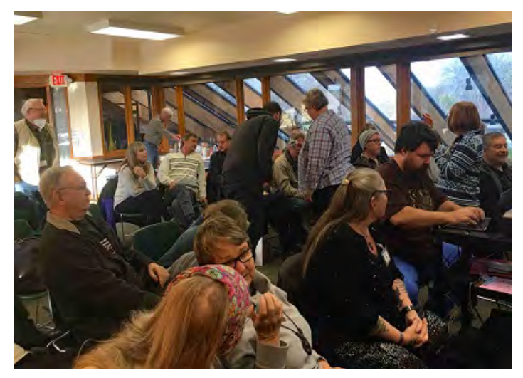
Discussing plants at the November meeting

The American Orchid Society is having their 3rd Annual Orchid Cul-