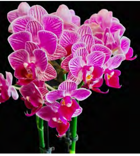
Meg McLaughlin's Unknown Mini Phal