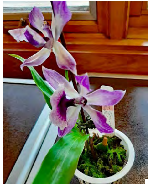
Terri Jozwiak's Zygonisia Cynosure 'Blue Birds'