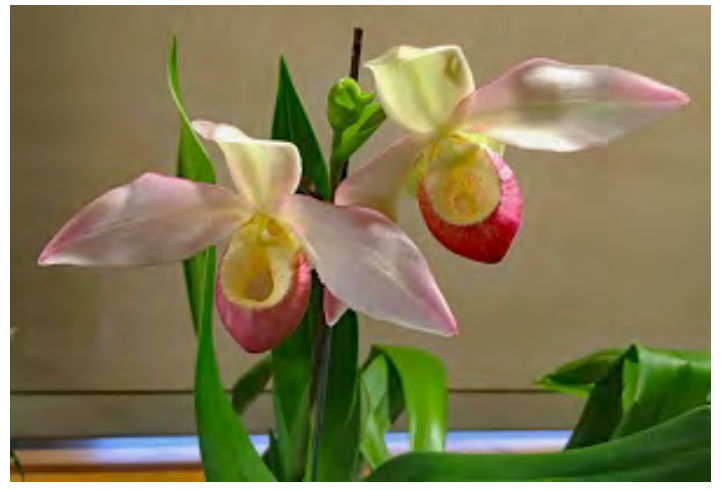
Meg McLaughlin's Phragmipedium Cape Sunset