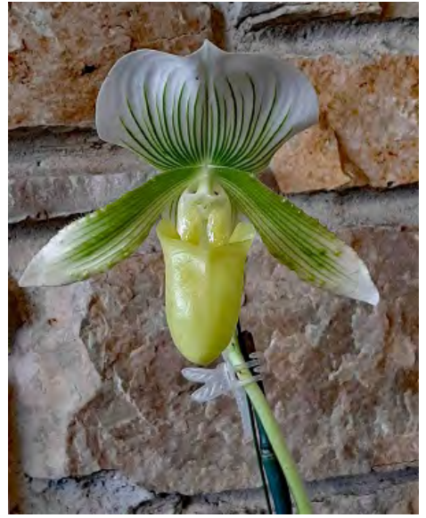
Paph Hilo Double Green 'Bruce's First' AM/AOS