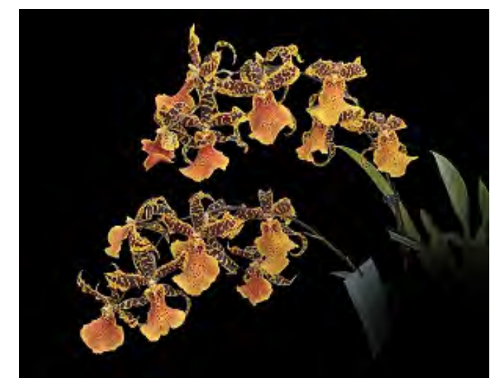
Aliceara Hilo Ablaze shown at the 2022 Fall Wisconsin Orchid Society Show

OGG annual membership renewals are coming due December 31. New members who joined this Fall are covered for 2023