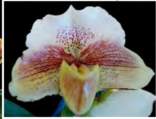
Paphiopedilum Lunacy 'Hampshire' x Resurrection Light