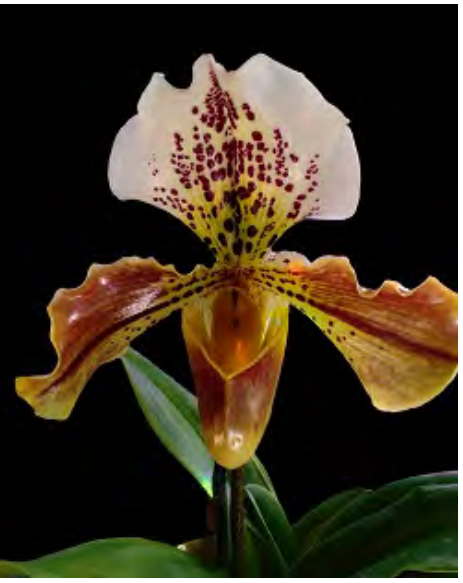
Paphiopedilum (Klehm's unlabeled hybrid from Woodman's West)