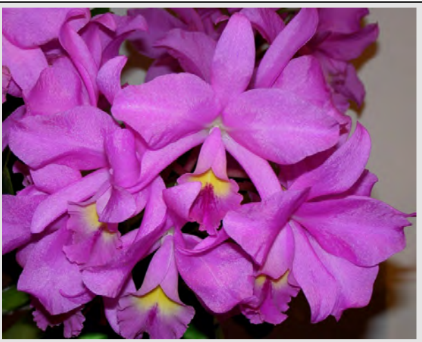
Cattlianthe Acker's Madison 'Kyle' (Cattlianthe Portia x Madison Green) CCM/AOS was developed at Acker's but registered by Hausermann's in 1985. "When we were in our hay-day of growing, there were some very interesting novelty Cattleya hybrids developed. Hausermanns would fly up in their little plane to see them and select plants to take back and clone for both our company's to grow and sell. They would also do the cross registration because my dad was not interested in spending the money to do so. He was a funny man when it came to such things."

The Orchid Grower January 2022 page 4 of 10