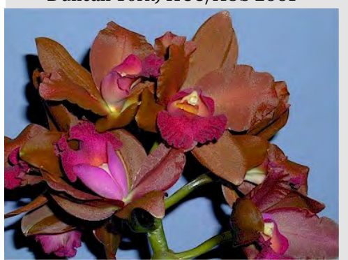
Cattleya Acker's Royal Hue (Acker's Sassafras x Mrs. Mahler) 2001