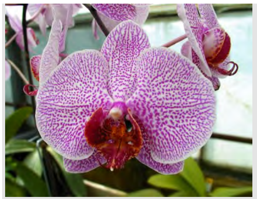
Phalaenopsis Acker's Sweetie 'French Candy' (Ho's French Fantasia x Taisuco Candystripe) AM/AOS 2003