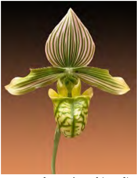
Nancy Thomas' Paphiopedilum venustum alba "First bloom seedling."