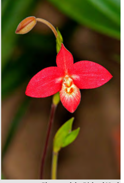
Photograph by Richard Narf Phragmipedium Waunakee Sunset (Barbara LeAnn x besseae) 2003

Photograph by Richard Narf Paphiopedilum Acker's White Cap (Yerba Buena x Acker's Pinnacle) 2002