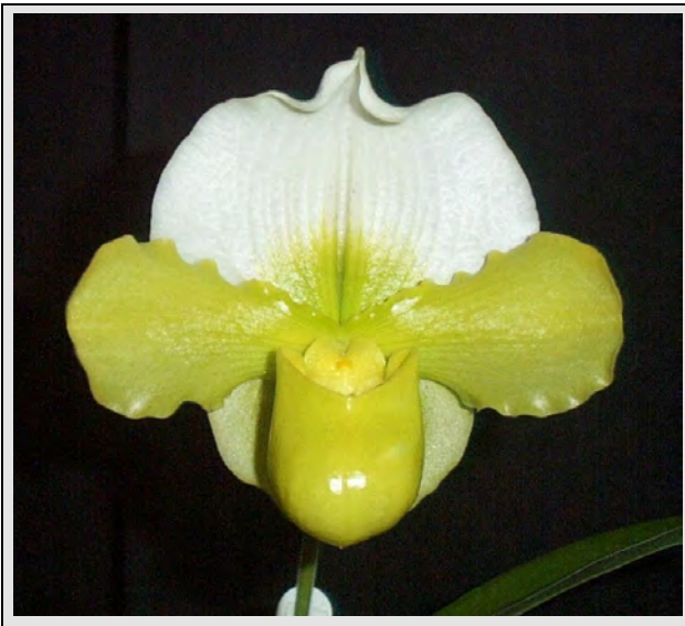
Paphiopedilum Acker's Wonderland (Wonder Isle x Yerba Buena) 2005