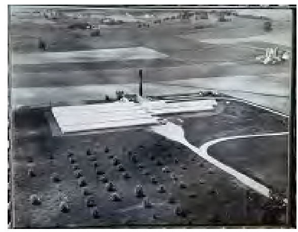
An aerial view of the place back in 1963

Carrying on in Doc's tradition my father and mother continued to raise orchids for the cut flower market through the mid 1970's. During that time the public started to show enough interest in orchid plants that it was decided to open our doors for retail plant sales. This would be a blessing in disguise because the demand for the cut orchid flowers was diminishing rapidly and the business needed a new direction. Not only were retail plant sales doing unexpectedly well, but there was also a great demand for wholesaling our orchid plants to other growers in our area and even Canada. Both facets of the business did one thing: they cleared the benches fast! There was now a need for a major revamping of plant produc-