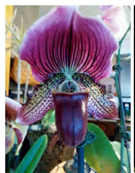
Paphiopedilum Hsinying Rubyweb x fairrieanum

There is a need for diversity here! Some of you must be hiding your light under a bushel, surely you have SOMETHING in bloom. You don't need a great camera, just a steady finger on the shutter. Photographs can be cropped to show your plant to its best advantage, so step up and send some in, PLEEZE!