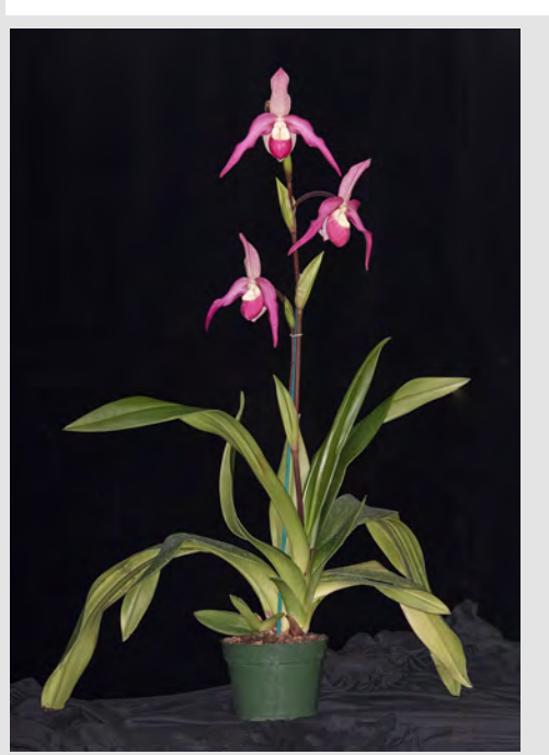
Phragmipedium Waunakee Wonder 'High Point' (Belle Hougue Point x Barbara LeAnn) 2005

Cattlianthe Acker's Romance 'Valentine' (Acker's Madison x Golden Wax) HCC/CCM 2005