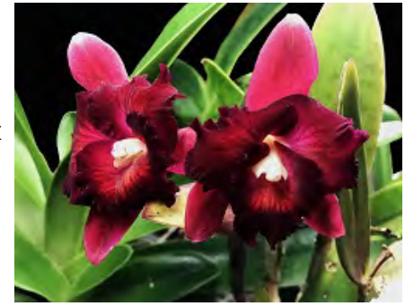
Sue Reed's Mini Catt

really small orchids. While their size intimidates some people, miniatures are just as hardy as their larger relatives. What makes them so appealing is their variety of form in addition to flower, and they are just plain cute! The fact that they take up so little space means that you can have a lot of variety in a limited area. Bigger definitely is not better