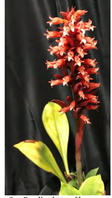
Sue Reed's photo of her Stenorrhychos speciosum