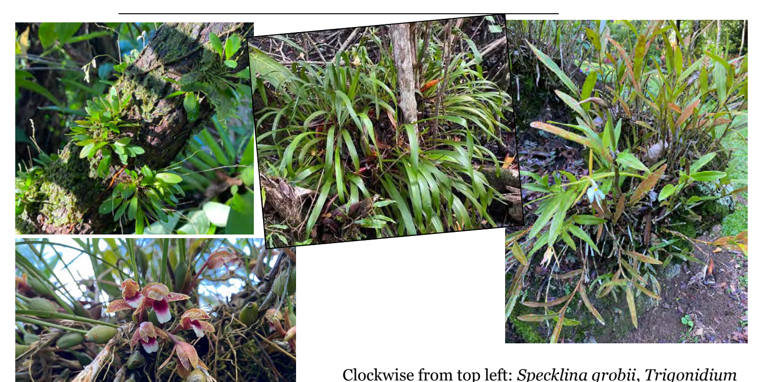
The Orchid Grower June 2022 page 4 of 6