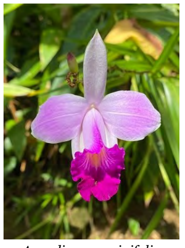
Arundina graminifolia (Asia)

Specklina grobii and Epidendrum parkinsonianum. On a cacao tree in the Green Acres Organic Chocolate Farm was this beautiful Maxillaria sanguinea plant covered in flowers. Based on my inexpert recognition of orchid genera, it looked like Maxillaria were pretty common in the