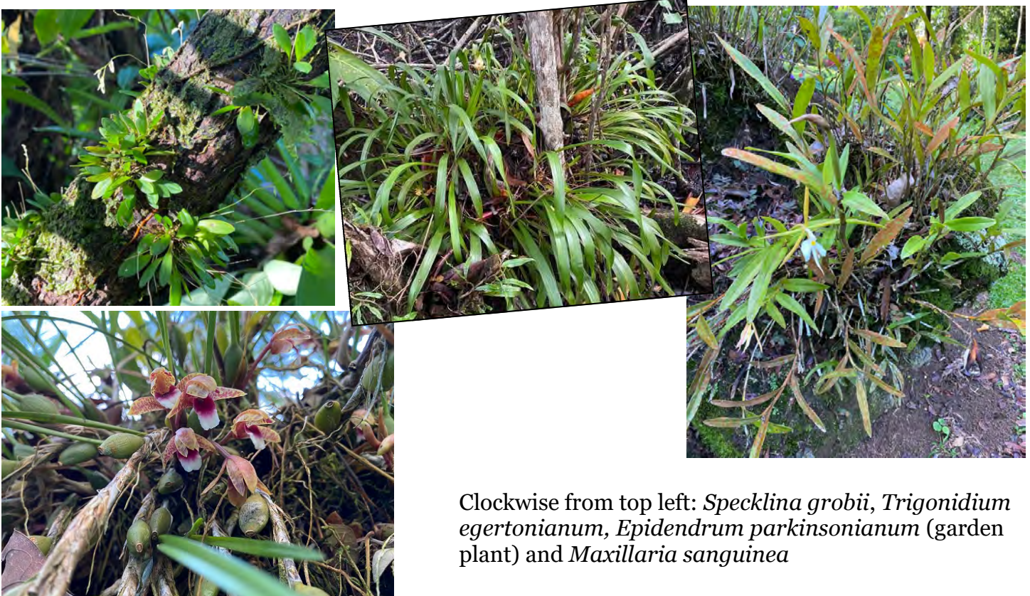
Clockwise from top left: Specklina grobii , Trigonidium egertonianum , Epidendrum parkinsonianum (garden plant) and Maxillaria sanguinea