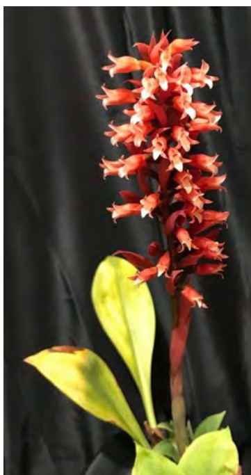
Sue Reed's photo of her Stenorrhychos speciosum