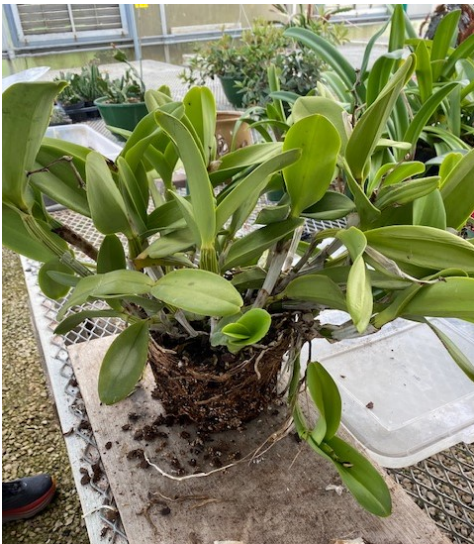
Chuck Acker divided this Cattleya into 5 separate plants which were auctioned at the September meeting

Chuck Acker's Q&A and repotting demonstrations were very enlightening, even for veteran orchid growers.