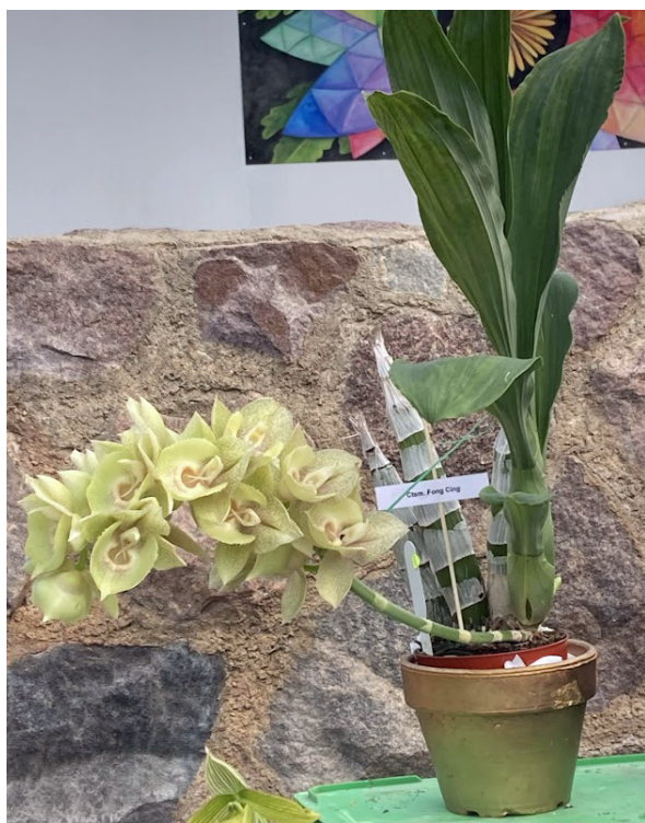
Photograph by Lorraine Snyder Ctsm Fong Cing?