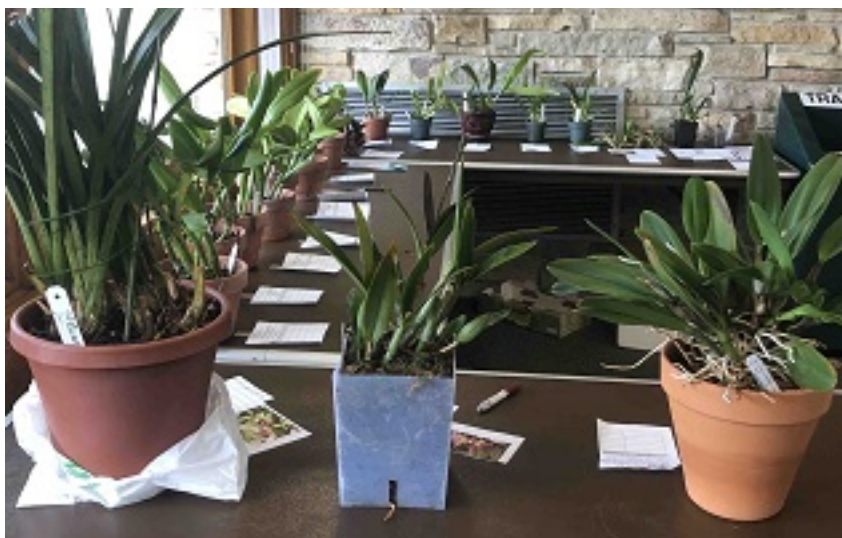
Plants and pots offered for auction