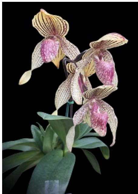
The Orchid Grower October 2022 page 4 of 8 Paph Mark Hasegawa