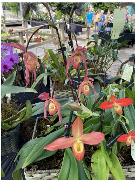
Phragmipediums in the OGG exhibit

PS: Board meetings are the first Tuesday of the month! All are welcome, just let me know to send you a zoom invitation.