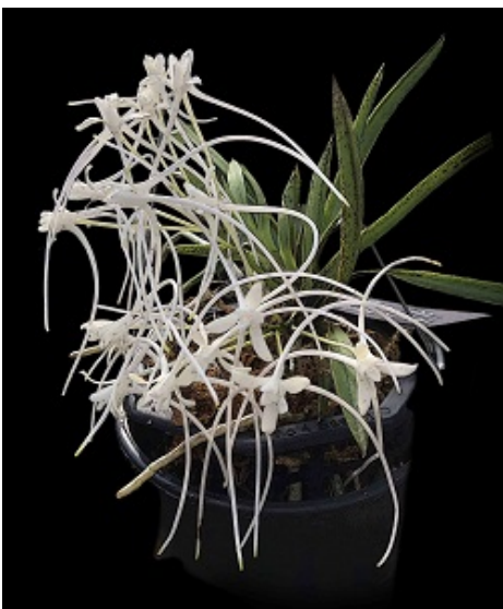
Vanda falcata 'Unjang'