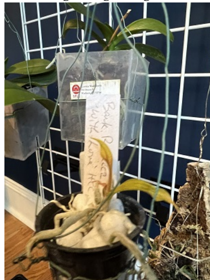
Another appears to be going dormant