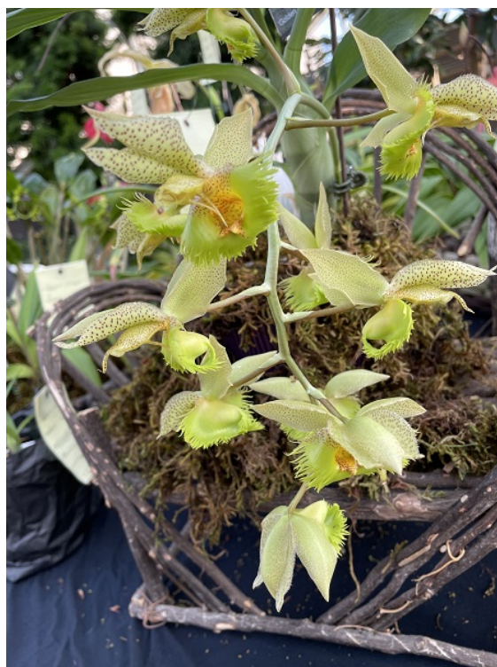
Lorraine Snyder's Ctsm ( fimbriatum 'Golden Horizon x osculatum 'SVO')