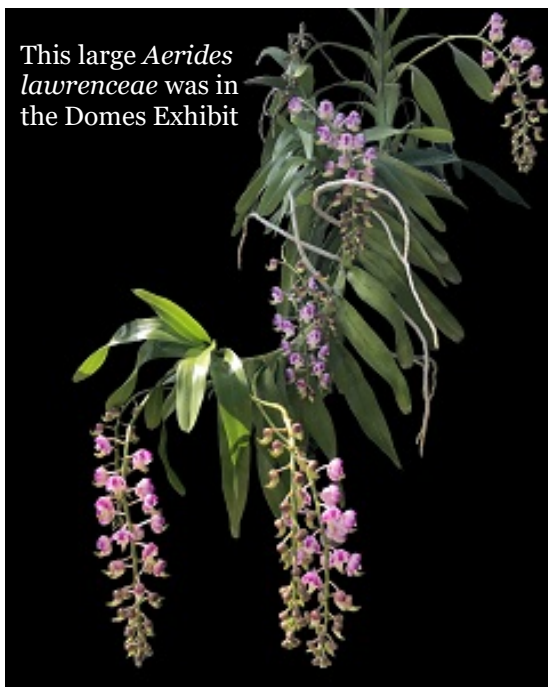
This large Aerides laurenceae was in the Domes Exhibit