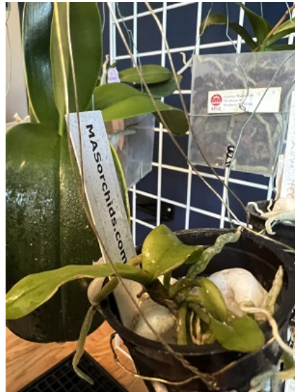
One of Cynthia's plants is still growing strong