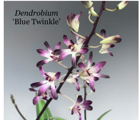
Dendrobium 'Blue Twinkle'

In March, the ad hoc Meeting Improvement Committee, implemented a new meeting lineup that will help ensure that all programmed activities receive adequate coverage while still allowing the meeting to wrap up on schedule. The meeting opened with highlights from the plant table by Chuck Acker and Ken Cameron. Once again members brought a large number and variety of outstanding orchids. New this month were the tri-fold table tent cards of seven major groups of orchids to help members locate the proper placement of their orchids on the tables making ribbon judging quicker and more efficient. Members have been emailed the ribbon judging form that can be printed at home and completed before the meeting.