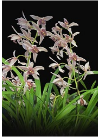
Gary Lensmeyer's Cymbidium Cherry Blossom 'Profusion' (floribundum x erythrostylum )

The Orchid Grower February 2023 page 8 of 9