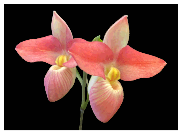
Meg McLaughlin's Phragmipedium Saint Ouen flavum Gold x Mitzi)