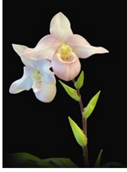
Chuck Acker's Phragmipedium Bubble Gum (Hanne Popow x Silver Eagle)