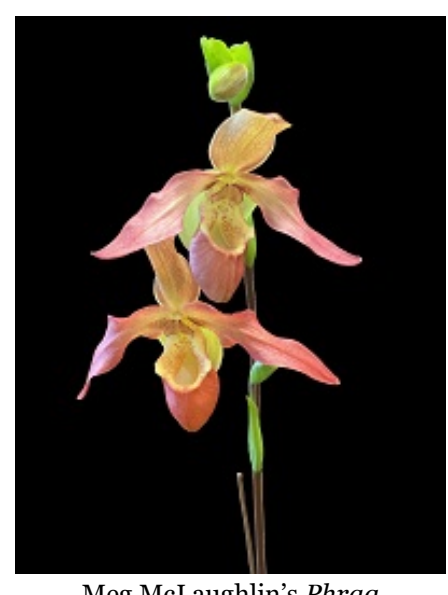
Meg McLaughlin's Phragmipedium Living Fire (besseae x Sorcerer's Apprentice