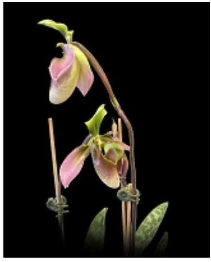
Meg Mclaughlin's Paphiopedilum hainanense x wolterianum