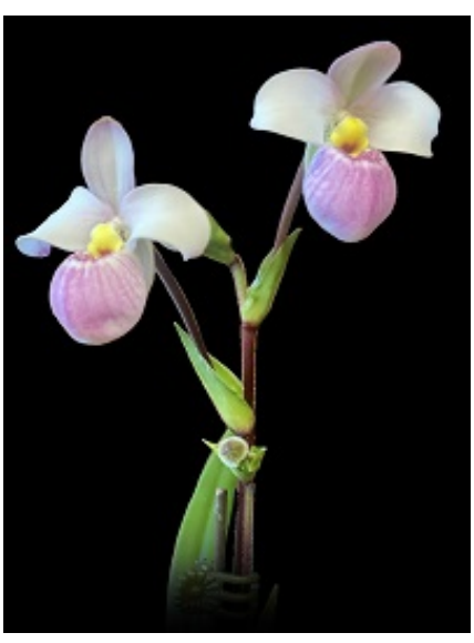
Chuck Acker's Phragmipedium Columbianum (schlimii x manzurii)