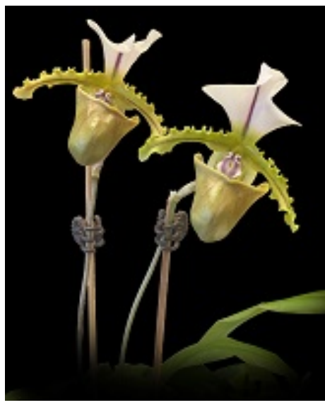
Meg McLaughlin's Paphiopedilum spicerianum