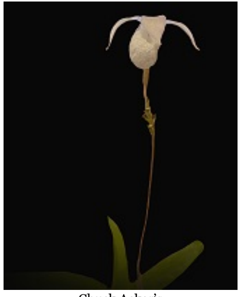
Chuck Acker's Mexipedium xerophyticum