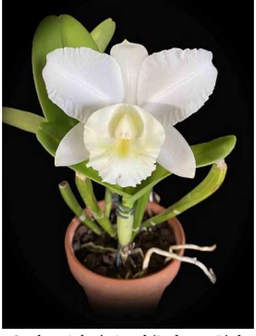
Cattleya Acker's Angel (Lodgen × Little Angel)

placed until I noticed that the bud had opened on October 23rd. It will be making its debut at the Eastern Iowa Orchid Society show the weekend of October 28 and 29.