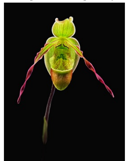
Phrag Conchiferum( caricinum × longifolium , old cross from 1881). No ribbon in Milwaukee

Sue Reed grows these under LED lights in the basement. The temperature never goes above mid 70's and not below mid 60's. The Diplocaulobium pulvillliferum is kept constantly wet.