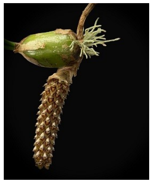
Gary Lensmeyer's Bulbophyllum crassipes