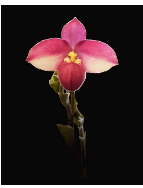
Chuck Acker's Phrag Acker's Rose River (Inca Rose x Fall River)