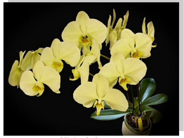
Meg McLaughlin's Phalaenopsis Star Green Beauty 'M251' (Ming Hsing Moonlight x Golden Apollon) appears to be yellow in this photo but it is actually a pale green