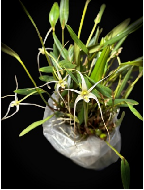
Sue had two plants of Diplocaulo-bium pulvillliferum ready to send to the Wisconsin Orchid Society Show. Timing is everything as the flowers last prime for one day, then the second day they turn pink. One opened and then the last one opened up on Thursday before the show. The one grown in a glass container had 7 blooms. The other one is grown in an open ziplock freezer bag and it had about 5 blooms.