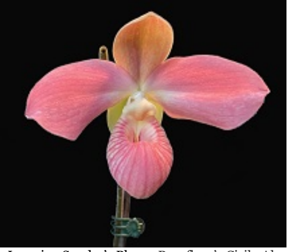
Lorraine Snyder's Phrag. Peruflora's Cirila Alca. (kovachii x dalessandroi)