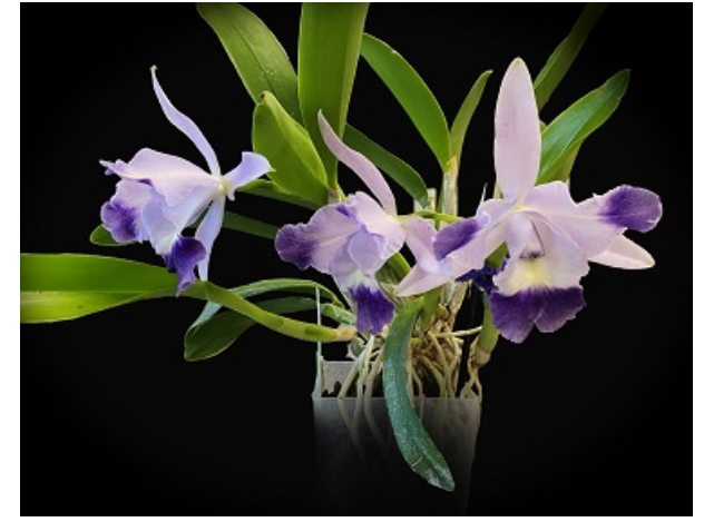
Sandra Gray's Cattleya Cariad's Mini-Quinee 'Angel Kiss' (Mini Purple x intermedia )