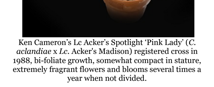
The Orchid Grower November 2023 page 8 of 11\,