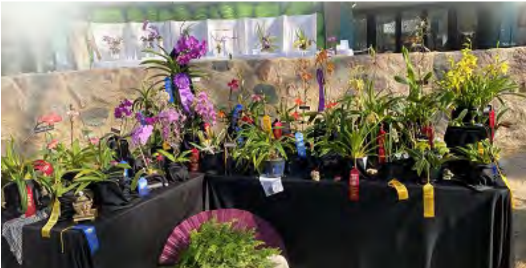
Orchid Growers Guild exhibit. First Place