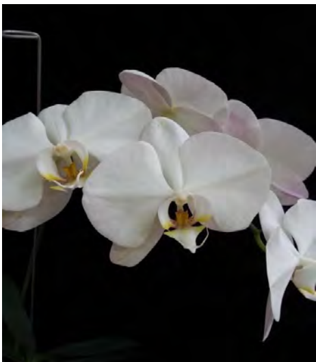
White Phalaenopsis, was a gift in 2019 The Orchid September 2023 page 9 of 12