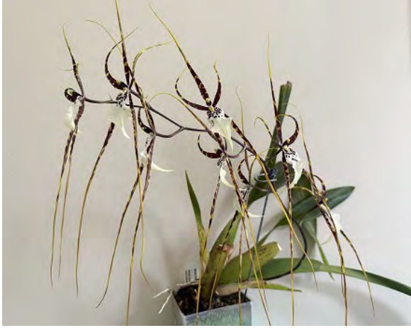
Nancy Thomas' Bratonia/Miltassia Kauai's Choice ( Brs. arcuigera x Brat. Aztec ). "The vertical height (upper "tendrill" tip to lower "tendrill" tip) of this Brassia hybrid is 11-12 inches"