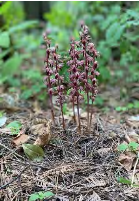
Corallorhiza striata found along the trail at Toft Point Natural Area