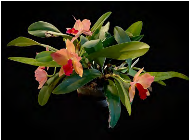
Jeff Baylis' Sophrolaeliocattleya Circle Doll (Circle of Life x Yellow Doll). This orchid is from Klehm, Denise purchased it at Woodman's West. Jeff grows it in a south window under supplemental lights, moved outside in spring until it initiated buds