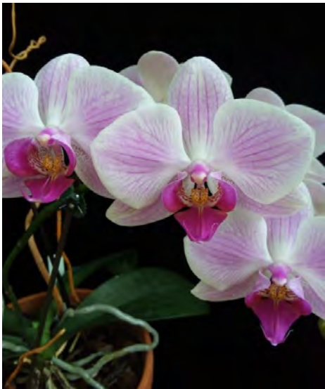
Pink Phalaenopsis, Y. Boy