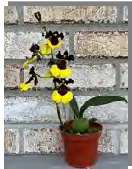
Oncidium Jiaho Queen

This variety is an intermediate grower, very compact in stature, requires bright indirect