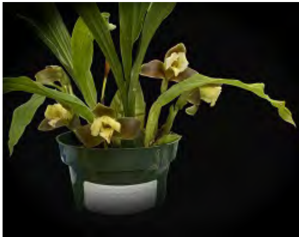
Susan Reed's Lycaste dowiana

stigma for fertilization. The unique characteristic of this plant is that it produces flower spikes with ovaries and buds which never blossom. (Orchid Web)