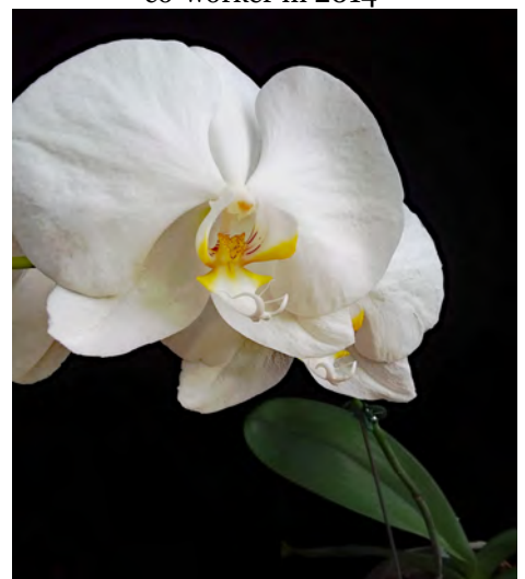
Phalaenopsis (Taisuco Kaaladian 'From Blanchi' x Three Rivers 'Big Markie'), obtained in 2005