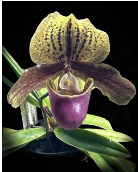
Paph (Doll's Kobold 'FV' x Little by Little 'War Eagle' HCC/AOS), first bloom seedling from Ross