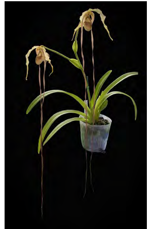
Terri Jozwiak's Phragmipedium Stairway to Heaven ( popowii x wallisii )