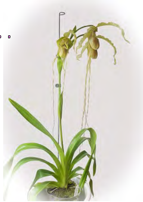
Judy Stevenson's Phragmipedium Giganteum ( caudatum x Grande 'Vista' 4n)