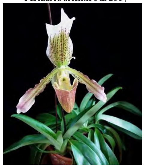
Paphiopedilum , was adopted from a co-worker in 2014