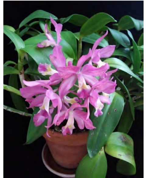
Lc. Acker's Madison x Slc. Golden Wax Purchased at Acker's in 2004