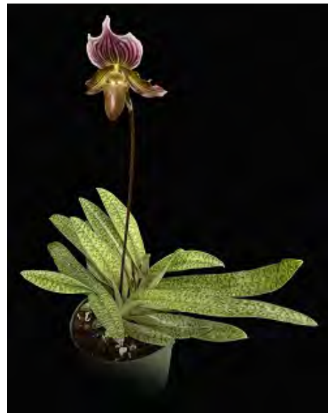
Ken Cameron's Paphiopedilum maudiae 'Los Osos' x fairrieanum '1-02'