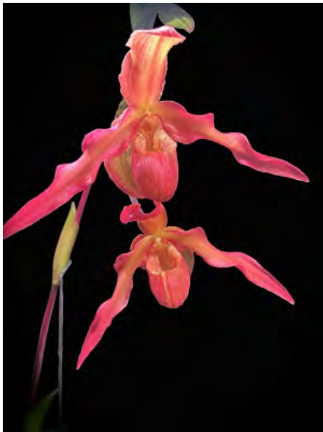
Phrag Red Rocket (Demetria 'Mem Con Walker' HCC/AOS x Twilight 'Rising Rocket' 4N AM/AOS)