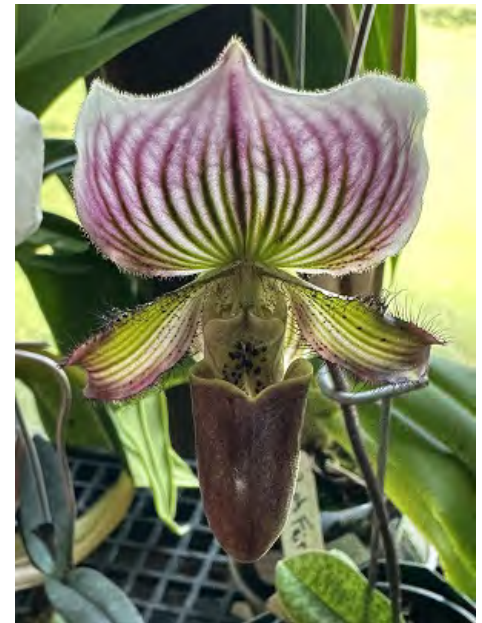
Paph Faire-Maud fairrieanum x Maudiae )

Just as I wonder whether it's going to die, the orchid blossoms and I can't explain why it moves my heart, why such pleasure comes from one small bud on a long spindly stem, one blood red gold flower opening at mid-summer, tiny, perfect in its hour.