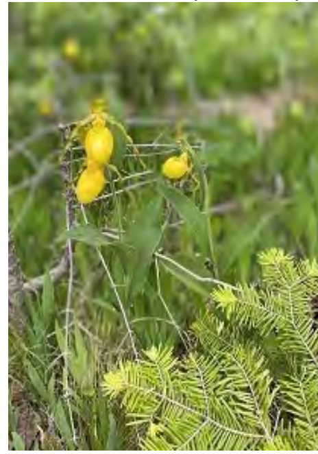
Cypripedium calceolus at the Ridge's.

Lorraine Snyder, Judy Stevenson and I made our annual visit to Door County in search of blooming orchids the second week of June. This year the orchids at Ephraim County Park were almost done blooming while the orchids at the entrance to Peninsula State Park were going strong. We found at least one Cypripedium in bloom at every park we visited. Toft Point Natural Area also had coral root orchids as did the Ridges. Years ago we used to see swaths of yellow ladyslippers in the ditch along Ridge Road but now that the area has become developed they are mowed by the property owners. We expect to find Cypripedium and coralroots in at least one location but we always hope to find a different orchid.