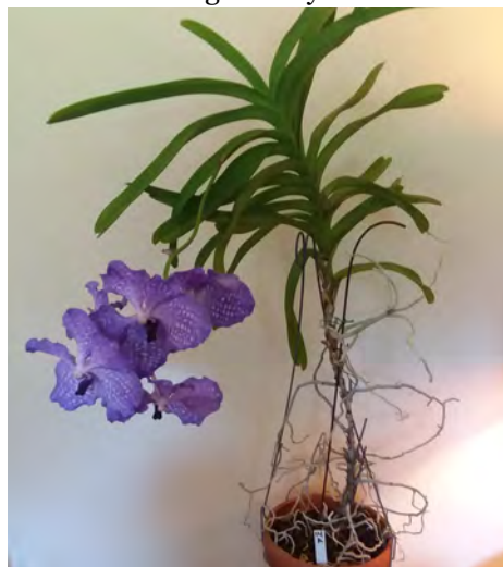
Vanda Sansai Blue 'Ackers Pride' FCC/AOS. Purchased at Acker's in 2002