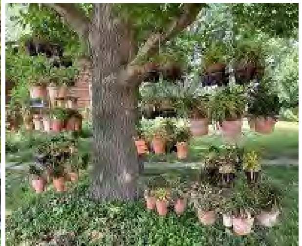
Summer growing system for a large collection of "Samurai" orchids