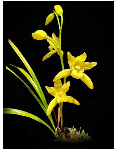
Cym. Golden Elf Sundust' ( ensifolium x Enid Haupt)