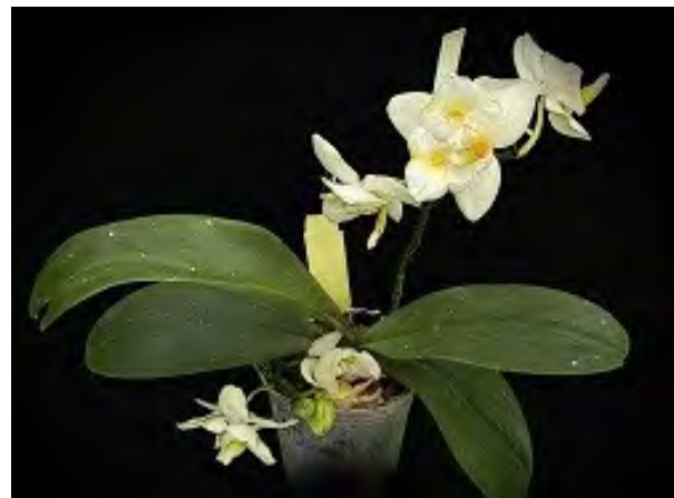
Gerry King's Phalaenopsis Liu's Pale Micholitz 'KF #1' (Culiacan x micholitz )