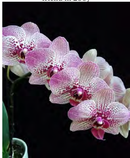
Pink and White Phalaenopsis. Was a gift last year