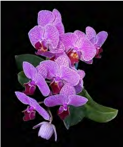
Sandra Gray's Phalaenopsis Unknown hybrid