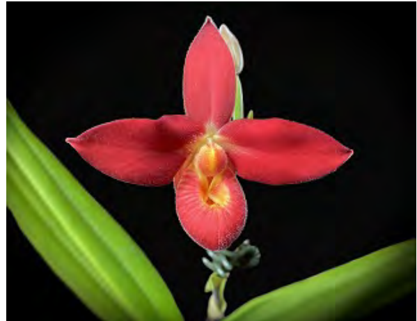
Judy Stevenson's Phragmipedium Acker's Angel ( besseae 'Rocket Town' x Acker's Lovely 'Essence')