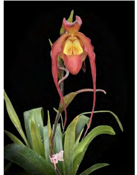
Jeff Metcalf's Phragmipedium QF Tower ( Nicholle Tower x wallisii )