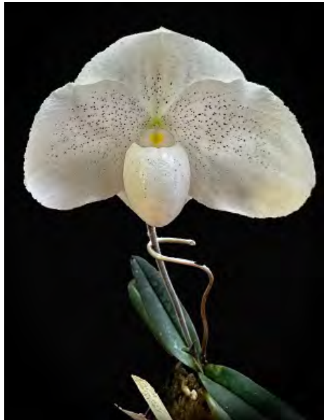
Paph (Grey's 'Sandstone' x Mystic Isle 'Hsinying')