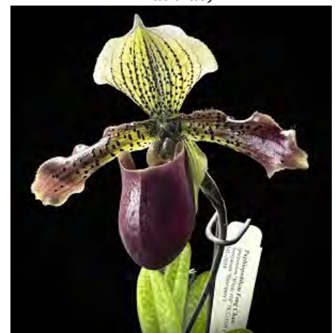
Paph Feng Chun ( henryanum x purpuratum )