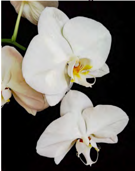
White Phalaenopsis, adopted from a co-worker in 2010