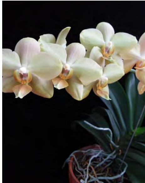
Yellow Phalaenopsis, adopted from a friend in 2007