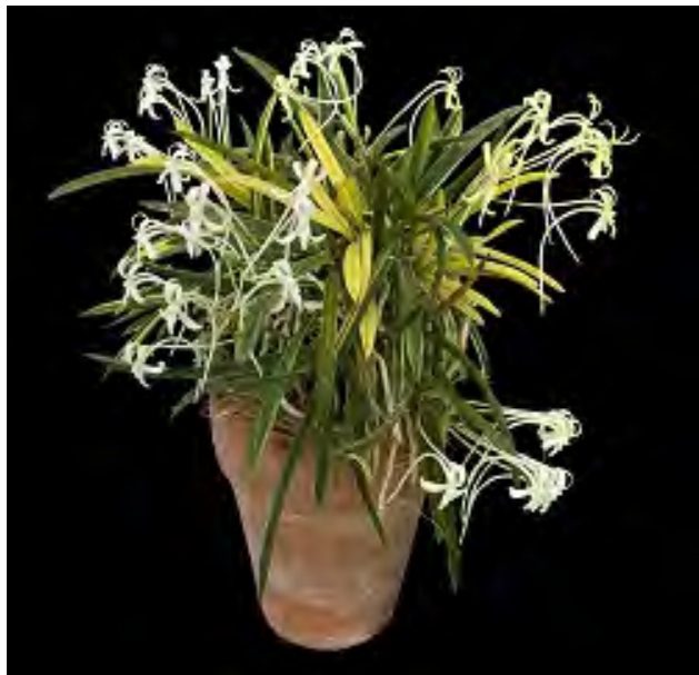
Ken Cameron's Neofinetia falcata Rain-No-Hikori 羅因の光

This variety is known for strong yellow stripes in the foliage, along with some red pigment along some of the margins (usually the lower leaves). Sometimes, it can send out growths with no variegation as well. If grown well the yellow is quite bold! (Orchid Web)