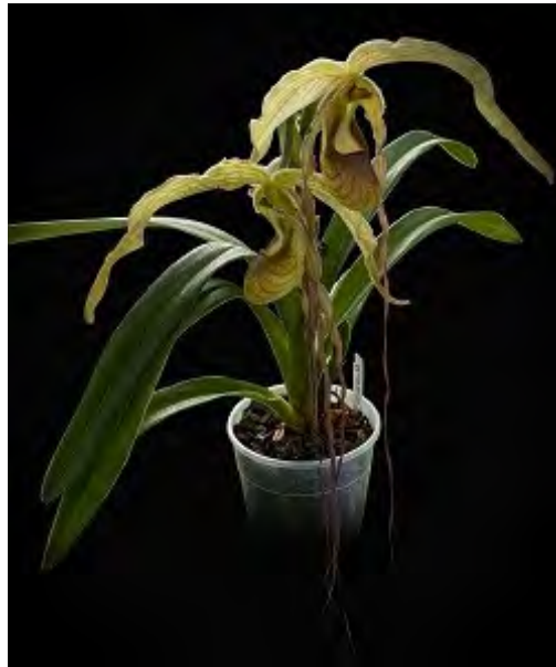
Terri Jozwiak's Phragmipedium Devil Fire (Grande x warscewiczianum )