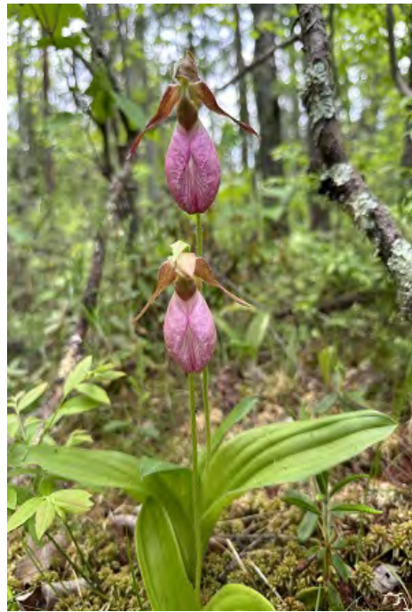
Pink ladyslipper, Cypripedium acaule . "Despite the dry spring this year, pink ladyslippers were blooming in moist habitat near Hayward in May."