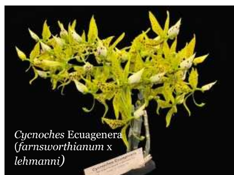
Cynoches Ecuagenera ( farnsworthianum x lehmanni )

There was a variety of different types of displays including photography, numismatic, needlework, artwork, origami and lego-type construction [see above]