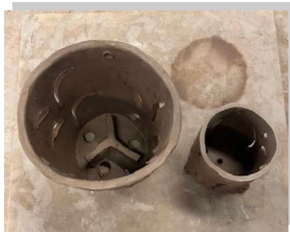
These photos show freshly made pots that aren't finished yet.