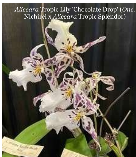
Aliceara Tropic Lily 'Chocolate Drop' (Onc. Nichirei x Aliceara Tropic Splendor)