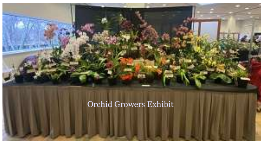
Orchid Growers Exhibit