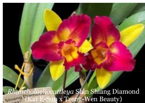
Rhyncholaeliocattleya Shin Shiang Diamond ( Kat E-Sun x Tzeng-Wen Beauty )