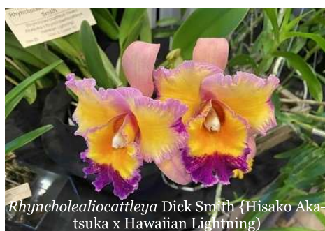
Rhyncholaeliocattleya Dick Smith (Hisako Akatsuka x Hawaiian Lightning)