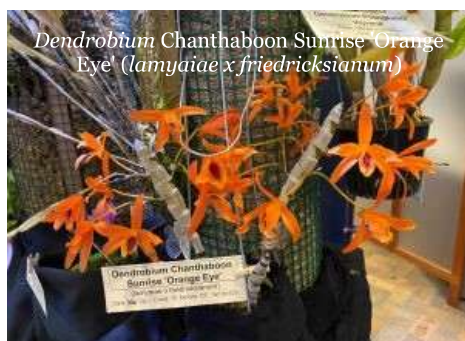
Dendrobium Chanthaboon Sunrise 'Orange Eye' ( lamiyanae x friedricksianum )