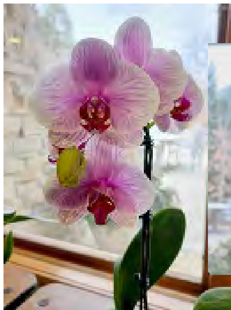
Dan Schmidt's Phalaenopsis NOID pink