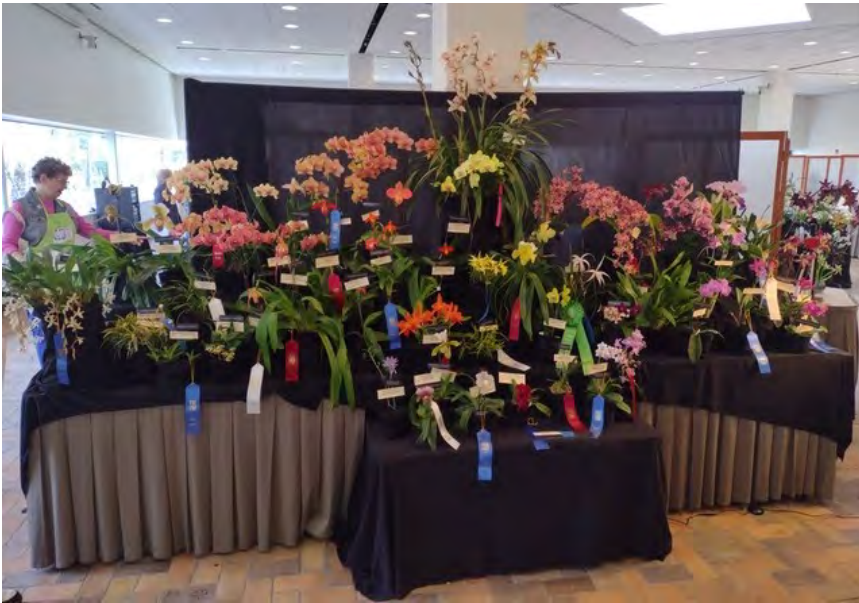
Orchid Growers Exhibit earned first place at the Chicago Show

Phalaenopsis Sogo Alania 'Solar Flare' (Haur Jin Princess x Sogo Meili) Paphiopedilum charlesworthii Phragmipedium Apopka (Leslie Gray x besseae ) Cymbidium goeringii 'Akagiyama' Paphiopedilum Joanne's Wine x Red Zinger (Joanne's Wine x Red Zinger) Maxillaria variabilis