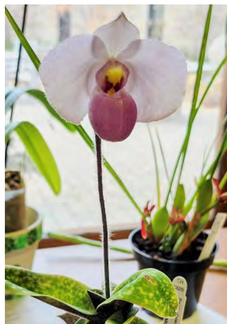
Lorraine Snyder's Paphiopedilum delanatii x sib