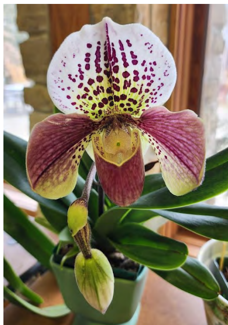
Wanda Buckingham's Paphiopedilum (Wilson's Mawr '208-13 x Nulight 'Hampshire')