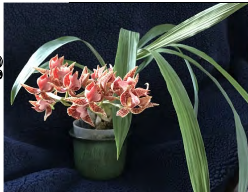
Gary Lensmeyer's Morm. Exotic Treat 'SVO' AM/AOS x Morm. andreetae 'SVO' AM/AOS

Steven Thimling's Ascocentrum miniatum , "is a warm grower so I grow it in my orchidarium, which also maintains a higher humidity. It is a monopodial orchid looking similar to a miniature vanda." The flowers are 12mm (1/2") across