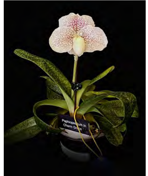
Lynn West's Paphiopedilum In-Charm Grace ( niveum form album 'Sogo' x In-Charm White 'Chao Chou' BM/TPS)