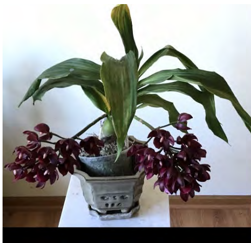
Gary Lensmeyer's Cycnodes Wine Delight 'Jumbo Orchids' BM/JOGA