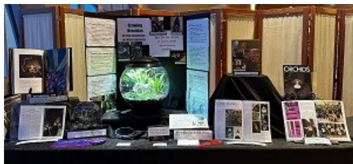
Growing Draculas by Sue Reed