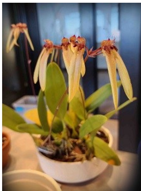
Terri Jozwiak's Bulbophyllum longiflorum