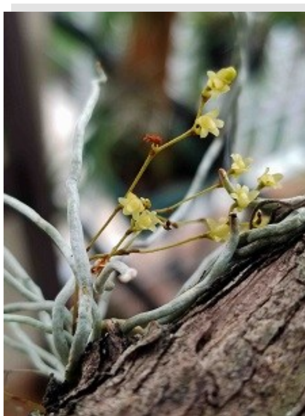
Jingle Bell Orchid in nature