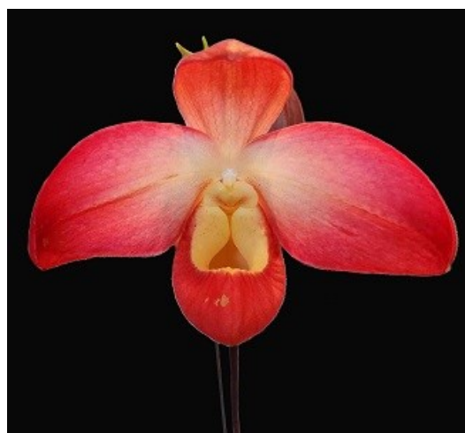
Chuck Acker's Phragmipedium Acker's Classic (Twilight × kovachii )

Orchid growing is not a matter of life or death, it's much more important than that.