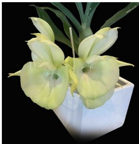
Catasetum pileatum ('SVO Independence' × 'Dinner Plate')