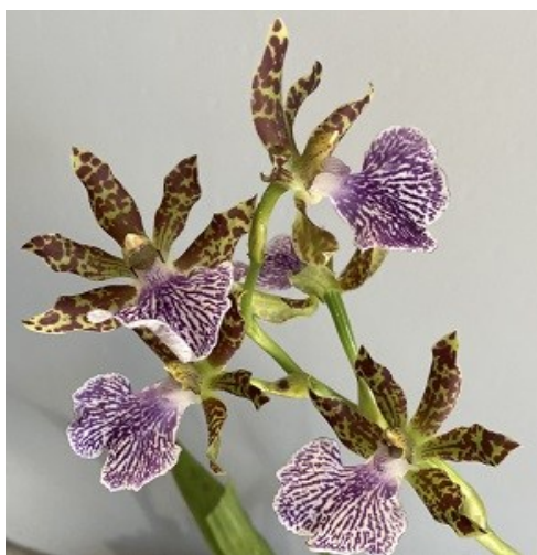
Gary Lensmeyer "This Zygopetalum mackayi is extremely fragrant with long-lasting blooms that perfume a good part of the house."