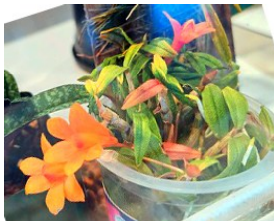
Sue Reed's Dendrobium Ecuagenera Vibes (Hsinying Paradise x cuthbertsonii )