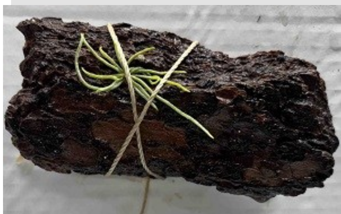
Mounted Jingle Bell Orchid