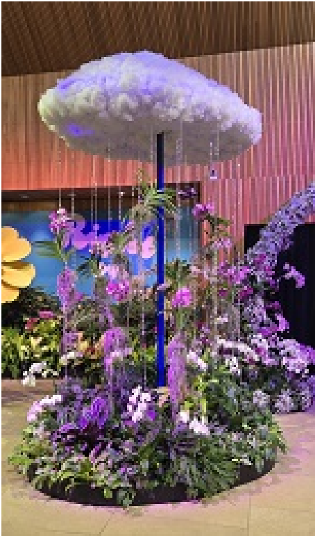
Remember lava lamps?

Starting the first week of February and into the middle of March, the Chicago Botanic Gardens hosts their annual themed orchid event. This year's theme was "Feelin' Groovy" which took us back to the 60's and 70's with themed music playing throughout the facility. There were many retro display sites including a ten-foot Lava Lamp and an old VW Bug with blooming Phalaenopsis spilling from its windows. Hundreds and hundreds of blooming orchid plants from many different genera were artistically displayed throughout the entire indoor area of the facility including the lobby, hallways and the area connecting the several glass conservatory greenhouses. The artistic design is always something to marvel upon and along with the hundreds of