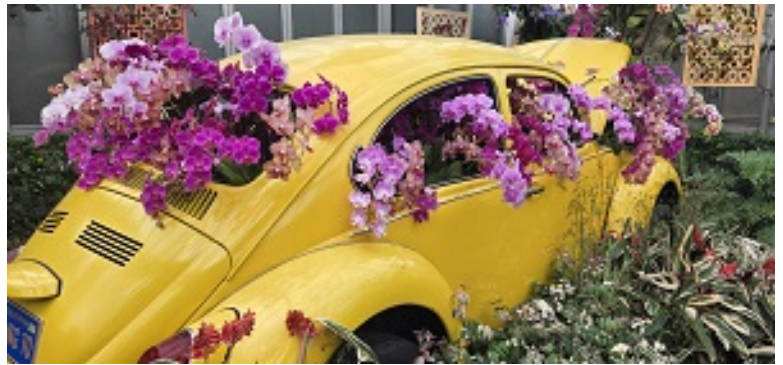
VW Bug with Phalaenopsis spilling from it

Starting the first week of February and into the middle of March, the Chicago Botanic Gardens hosts their annual themed orchid event. This year's theme was "Feelin' Groovy" which took us back to the 60's and 70's with themed music playing throughout the facility. There were many retro display sites including a ten-foot Lava Lamp and an old VW Bug with blooming Phalaenopsis spilling from its windows. Hundreds and hundreds of blooming orchid plants from many different genera were artistically displayed throughout the entire indoor area of the facility including the lobby, hallways and the area connecting the several glass conservatory greenhouses. The artistic design is always something to marvel upon and along with the hundreds of