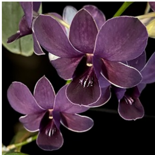
Dendrobium Sakda Blue