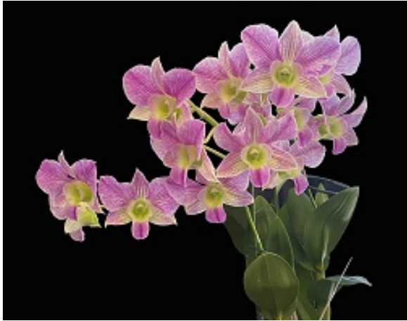
Dendrobium Hawaii Stripes (Mini Snowflake x Nida 'Stripes')