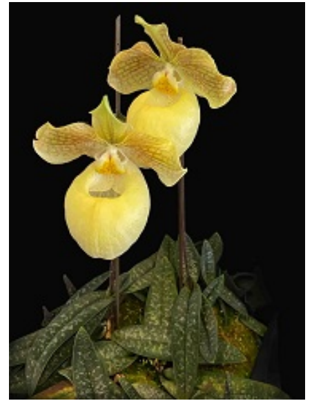
Paphiopedilum Fumi's Delight (micranthum eburneum x armeniacum)