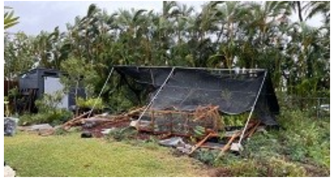
Unusual severe weather collapsed this backyard orchid shade house

Just 24 hours before Ken’s visit, Mount Kīlauea erupted violently spewing ash, tephra, and “Pele’s hair” (threadlike volcanic glass) high into the air. Normally this would not be a problem, but the eruption coincided with a rare and unusual weather pattern bringing a strong “Kona wind” from the south that dumped the volcanic debris across roads and inhabited area. Kona winds are opposite to the normal northeast trade winds that make Hawaii such a tropical paradise. Occurring mostly in winter, Kona winds are associated with local cyclones, bringing heavy rain, fog, and severe weather to the typically sheltered leeward sides of the islands. As a result, both orchid societies made a last minute decision to cancel their in-person meet-