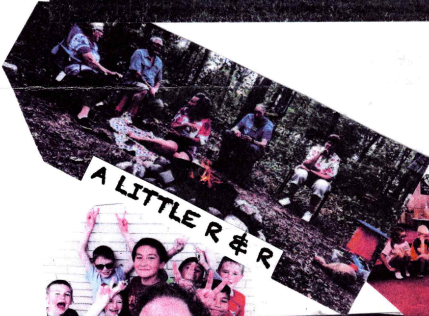
A LITTLE R & R