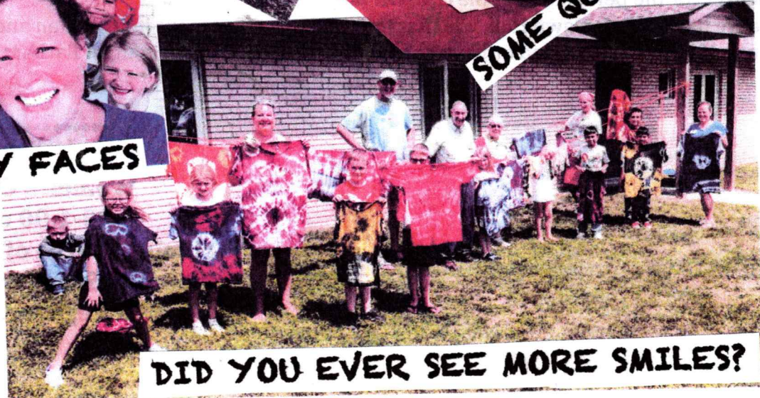
DID YOU EVER SEE MORE SMILES?