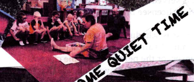
SOME QUIET TIME