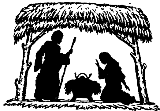
The Birth of Our Savior