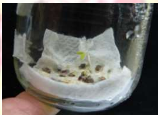
Rose hybridizing in winter months.