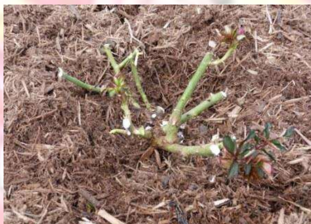
After pruning picture of a miniature rose.

For Climbers, you want to leave intact the long main canes and prune back to 4-5 inches of each lateral on each main cane.