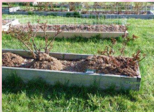
After pruning picture of 2 Shrub Roses.

For miniatures and minifloras, you want to prune away anything that is less thick than a pencil.