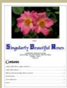
Singularity Beautiful Roses