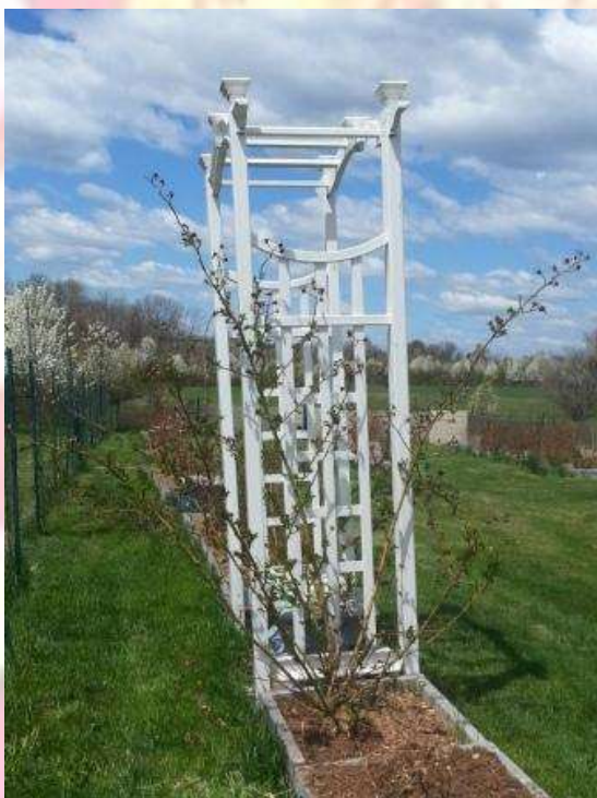
Before pruning picture of a Climbing rose.