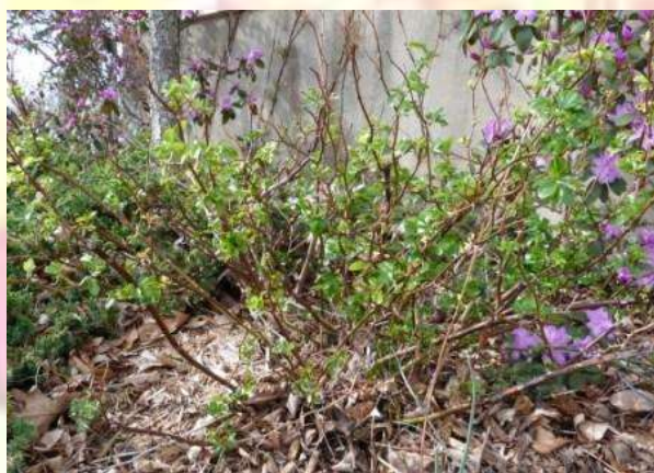
Before pruning picture of a Polyantha rose.

For Polyanthas, first take care of the 3 Ds and then prune back to healthy pith. Healthy pith should look white, not brown. However it is important to keep in mind that some varieties of roses do not have a white pith.