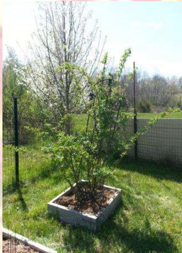
After pruning picture of a Hybrid Musk rose.

A. You will need a pair of loppers and bypass pruners. Anvil pruners are not good as they crush the cane instead of leaving a clean cut. A saw may be useful to prune off a large dead cane on an older rose. Goat skin gloves and a hat will offer good protection from thorns. A knee pad, Elmer's Glue, a large trash can, and a brush to remove the mulch closer to the bud union are also good to have.