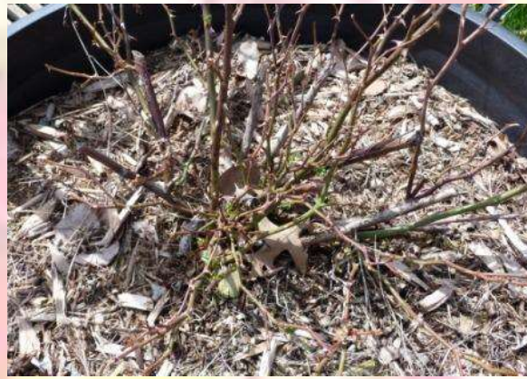
Dead and damaged canes.

A. Before pruning any rose, it is important to take into account what type of rose it is. Generally speaking, the pruning technique is different for different varieties of roses such as hybrid teas (HT), floribundas, climbers, shrubs, polyanthas, miniatures, OGRs, minifloras etc.