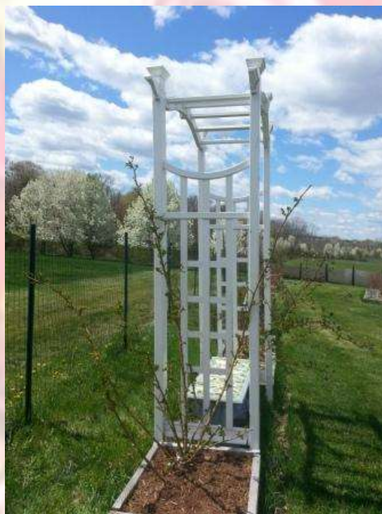
After pruning picture of a Climbing rose.

For Polyanthas, first take care of the 3 Ds and then prune back to healthy pith. Healthy pith should look white, not brown. However it is important to keep in mind that some varieties of roses do not have a white pith.