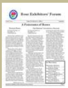
Rose Exhibitors' Forum