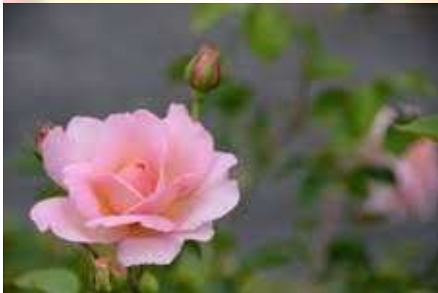
A rose at the Monmouth County Park System's Deep Cut Gardens in Middletown.

Click on the Articles button, and find a list of roses organized by no-spray, disease resistant; requires spraying for disease, will get black spot; and avoid, hard to grow, not worth the effort.