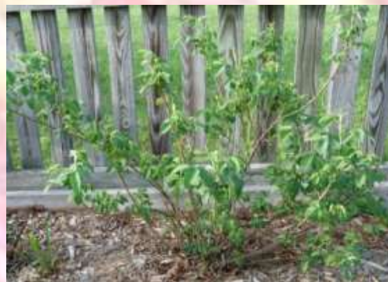
OGR Rosa Mundi