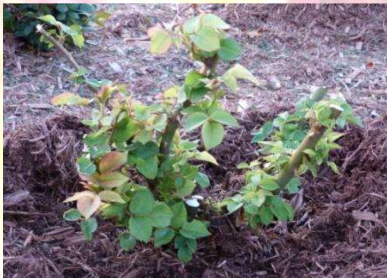
After pruning picture of a floribunda rose.