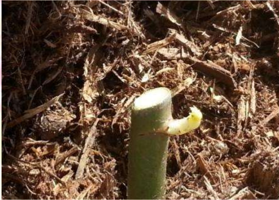
45 degree angle a \frac{1}{4} inch above an outward facing bud eye

While pruning, it is important to remove any canes that are growing inwards toward the center of the plant as these canes will prevent aeration in the center of the plant and make the rose susceptible to fungal diseases. You want to make a pruning cut at a 45 degree angle a \frac{1}{4} inch above an outward facing bud eye with the slope of the cut away from the bud eye.