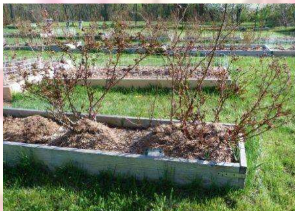
Before pruning picture of 2 shrub Roses.

For Shrubs, you can get away with being more ruthless. Some people use a hedge trimmer to trim their 6 feet tall Knockouts and they do just fine. However it is important to seal every pruning cut you make with Elmer's Glue so that borers will not enter the cane.