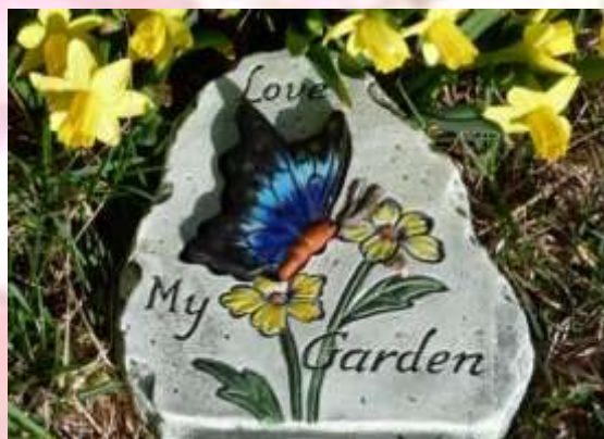
Garden accents in my garden.