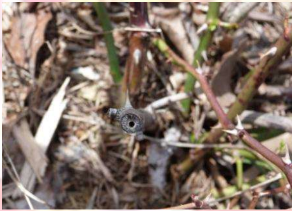
Borer damage and cross over cane.