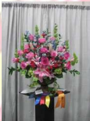
The New Jersey Flower and Garden Show.