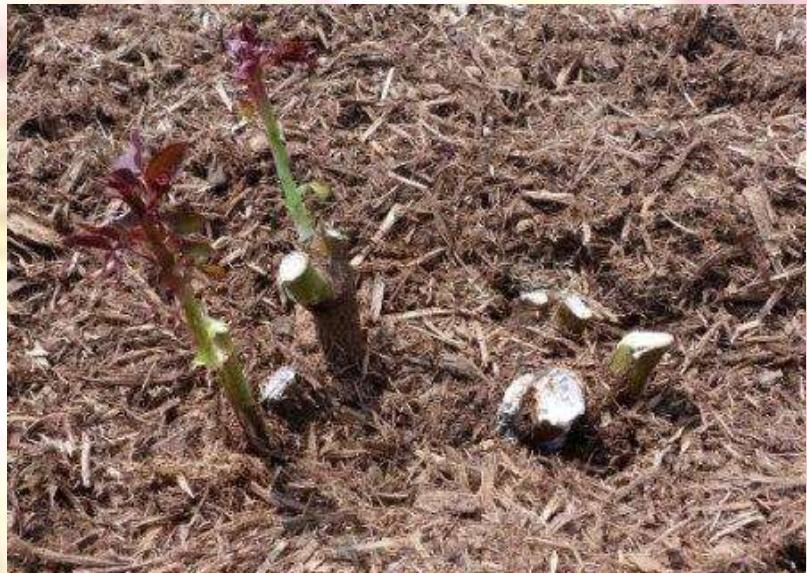
After pruning picture of a HT rose.

One thing that is common to all varieties is the 3 D rule – you need to remove anything that is Dead, Diseased and Damaged. Dead wood is mostly from winter die back. Diseased wood will show borer holes in the pith. Damaged wood is from broken canes or cross over canes rubbing against each other.