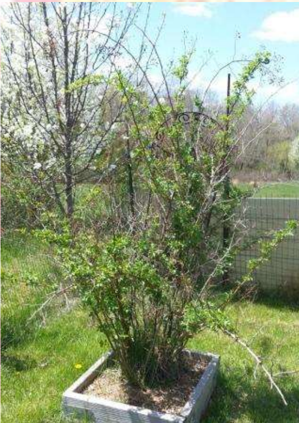
Before pruning picture of a Hybrid Musk rose.