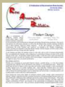
Rose Arranger's Bulletin