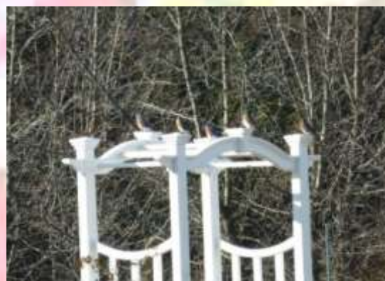
Photographs of my rose garden in winter.