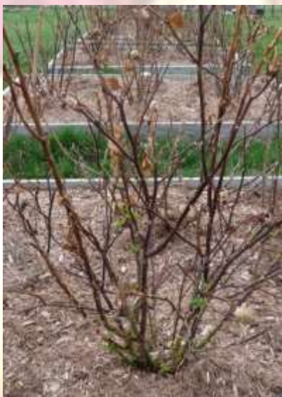
Before pruning picture of a floribunda rose.

For a Floribunda, you want to prune to a nice rounded form leaving many canes.