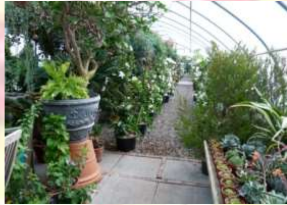
Atlock Farm and Garden Center in Somerset, NJ.