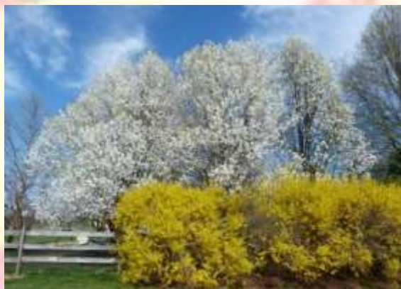
Forsythia blooming in Spring

A. For this part of the country, the correct time for pruning most roses except OGRs is when the Forsythia blooms in Spring. Do not prune in Fall as it makes the plant put forth new growth when we want the plant to go dormant for the winter and to store most of its reserves in its roots. The only pruning done in Fall is to prune extremely large canes ( not including climbers ) to about 5 feet in height so that the plant does not get tipped over or uprooted over winter with strong winds or the weight of the snow. Some Climbers can also be pruned a little if they have large lateral canes.