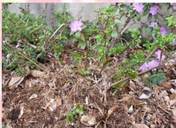
After pruning picture of a Polyantha rose.

For Hybrid Musks like Ballerina, very little pruning is needed. Only taking care of the 3 Ds and shaping the plant is needed.