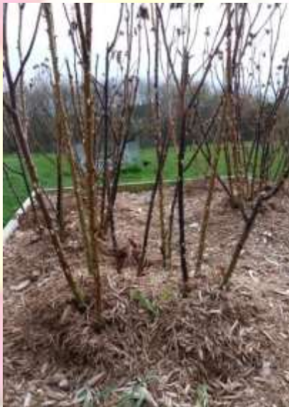
Before pruning picture of a HT rose.

A. Before pruning any rose, it is important to take into account what type of rose it is. Generally speaking, the pruning technique is different for different varieties of roses such as hybrid teas (HT), floribundas, climbers, shrubs, polyanthas, miniatures, OGRs, minifloras etc.