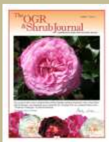
Old Garden Rose & Shrub Journal

National and District Rose Show Results and up-dates to Modern Roses 12 are also available.