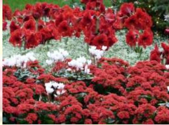
Longwood Gardens Conservatory.

Finally, if I wake up to a bad day of winter blues, I visit the Conservatory at Longwood Gardens in PA where in the middle of winter I can sit in a rose garden in full bloom and smell the roses!