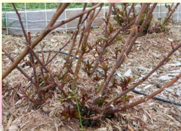
Before pruning picture of a miniature rose.

For miniatures and minifloras, you want to prune away anything that is less thick than a pencil.