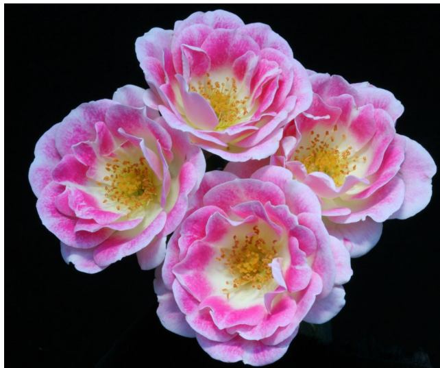
'Whimsy'